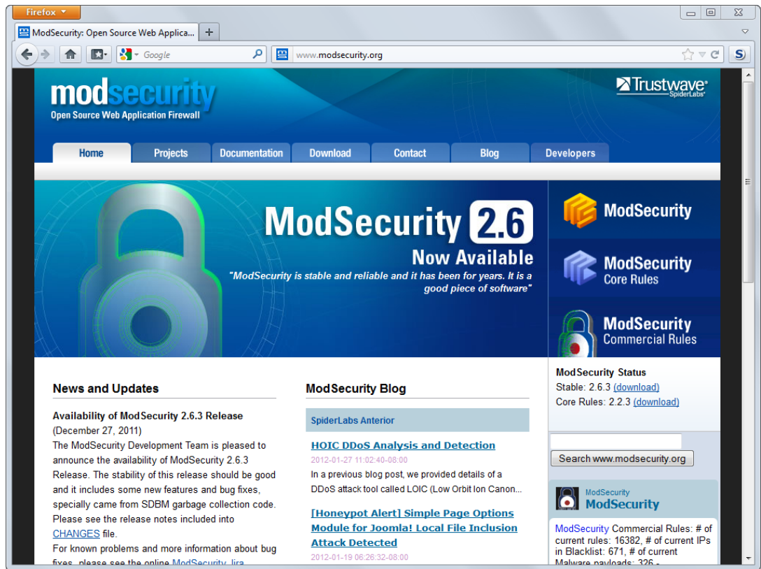
Figure 2-1. The homepage of www.modsecurity.org