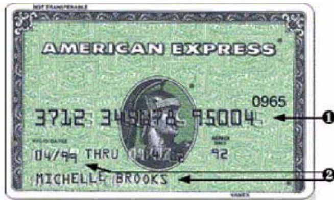
Figure 4-5. Example of Fraudulent Embossing

Characteristics of fraudulent Embossing include: