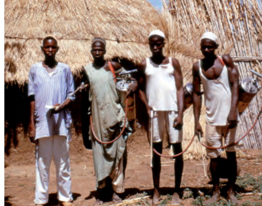
An indoor residual spraying team in a village in northern Nigeria

People with sickle-cell anaemia, a genetic disorder, are less likely to contract malaria and tend to survive in areas where the disease is widespread. This is because their haemoglobin, the oxygen-carrying part of the red blood cell (RBC), is defective. Consequently, these individuals have a low binding capacity for oxygen and are 50% less efficient at