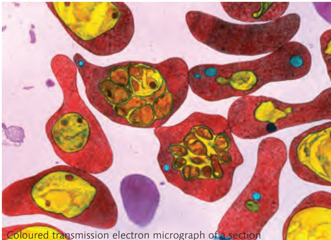
Coloured transmission electron micrograph of a section through red blood cells infected with the malaria parasite

Inside the RBCs the individual merozoites develop into trophozoites and finally into schizonts <sup>(6)</sup> which contain up to 32 distinct merozoites, depending