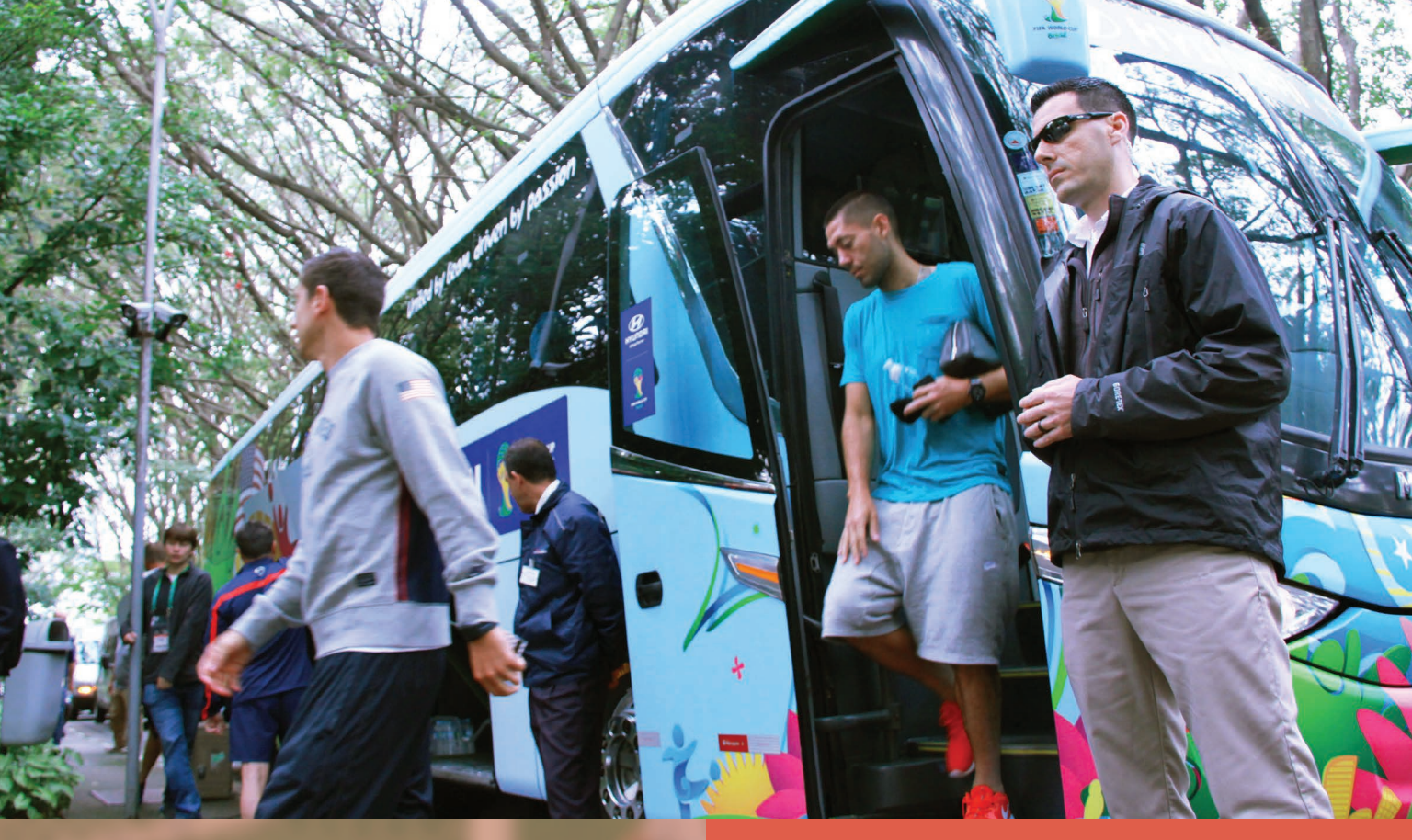
Scanning the vicinity, the Diplomatic Security special agent (right) provided protective services for U.S. athletes competing in the 2014 World Cup in Brazil.