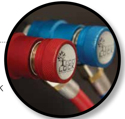
ECO LOCK Quick Couplers