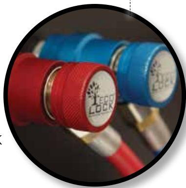
ECO LOCK Quick Couplers