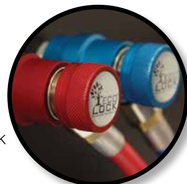
ECO LOCK Quick Couplers

Engineered to prevent gas dispersion into the environment.