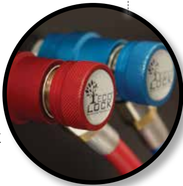
ECO LOCK Quick Couplers