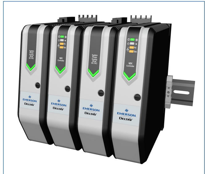
The DeltaV™ MX Controller and the DeltaV I/O subsystem make rapid installation easy.