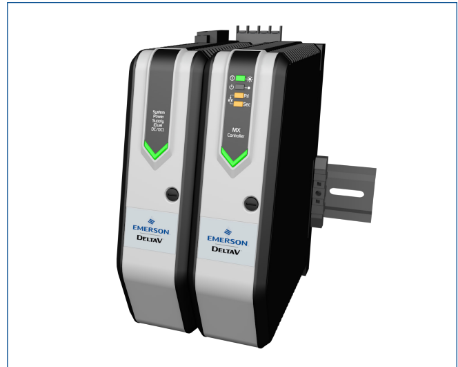
The MX Controller.

Cold restart. This feature provides automatic restart of the controller in case of a power failure. The restart is completely autonomous because the entire control strategy is stored in NVM RAM of the controller for this purpose. Simply set the restart state of the controller to current conditions.