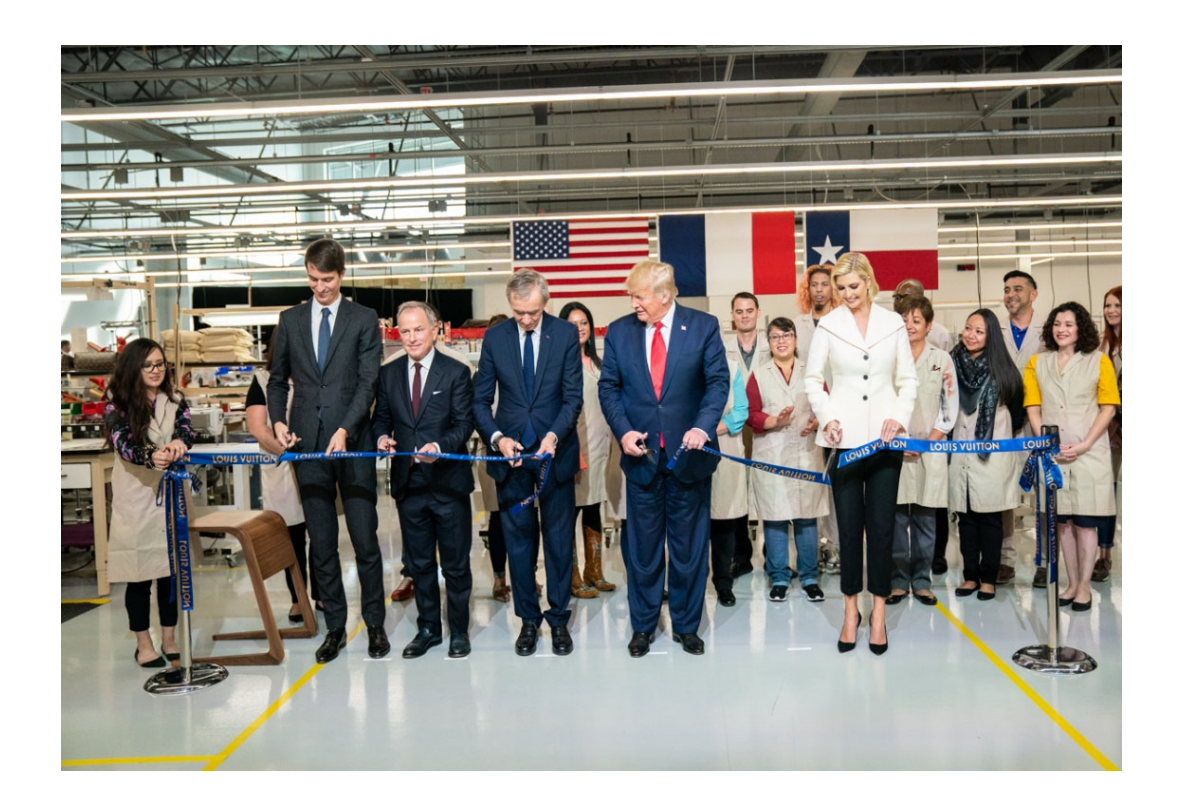
Exhibit 3 Ribbon Cutting Ceremony for the Texas LV Factory