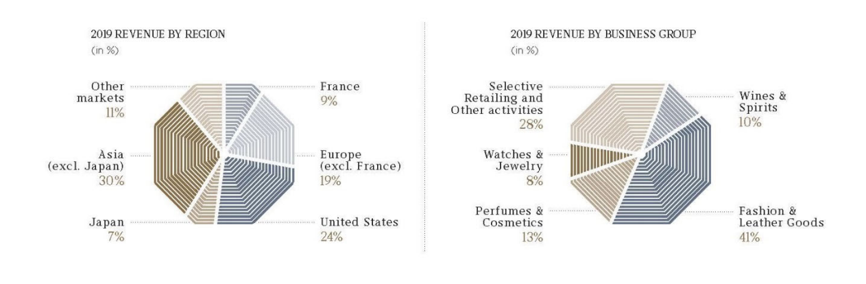
Exhibit 2 LVMH - 2019 Revenue Breakdown by Geography and Business Group

GEOGRAPHIC FOOTPRINT (as of December 31, 2019)