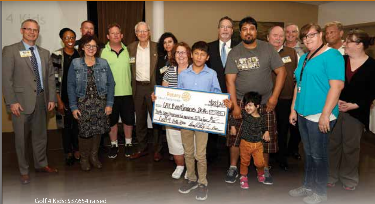
Golf 4 Kids: $37,654 raised

Rotary Club of Sacramento 1451 River Park Dr., Suite 120 Sacramento, CA 95815 (916) 929-2992 RotarySacramento.com