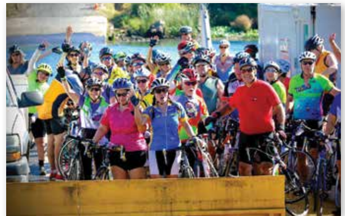
The Full Century included six Delta islands and a ferry crossing.