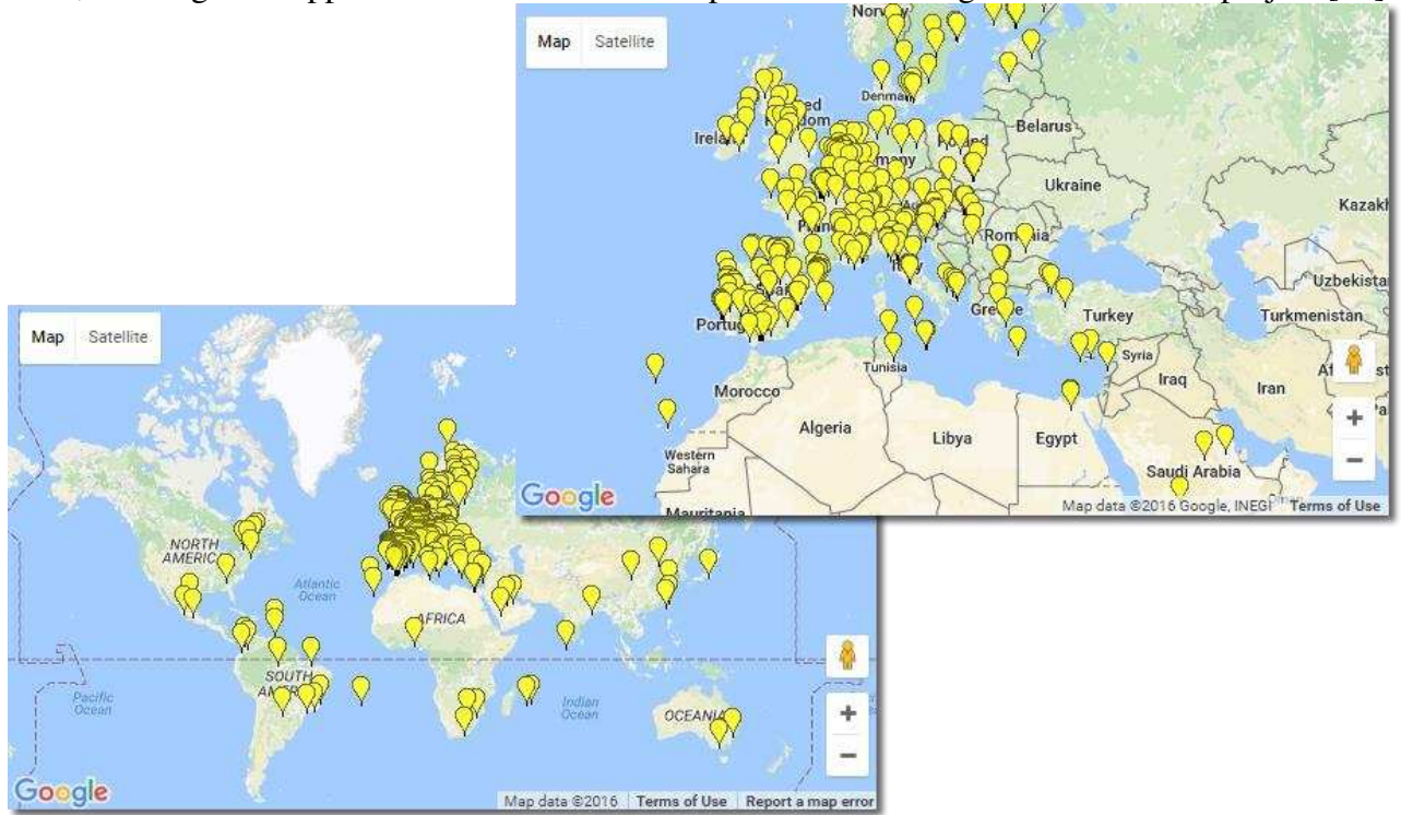
Fig. 3. Living Labs in ENoLL member states [11]

In this context, The European Network of Living Labs (ENoLL) is a relevant example of how important the connection between living labs, ICT and social innovation is. Founded in 2006, ENoLL is the international federation of benchmarked living labs at European and global level. Today, it counts more than 170 active living labs worldwide, providing to its members co-creation, user engagement, test and experimentation services, having as a main target innovation in various fields of activity. This not for profit association acts as a platform for exchanging best practice cases, learning and support and also for the development of the living lab international project [11].