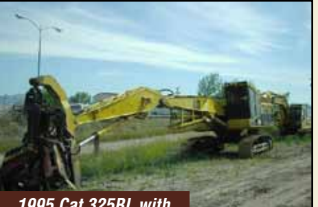
1995 Cat 325BL with Waratah Processor