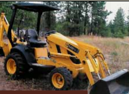
2009 JCB Mini Backhoe