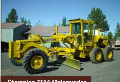
Champion 715A Motorgrader