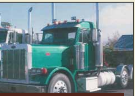
2000 Peterbilt 379 Tri-Axle Tractor