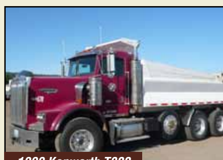
1999 Kenworth T800 Tri-Axle Dump Truck