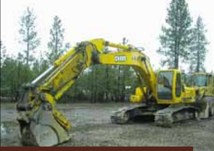
1999 John Deere 230 Excavator