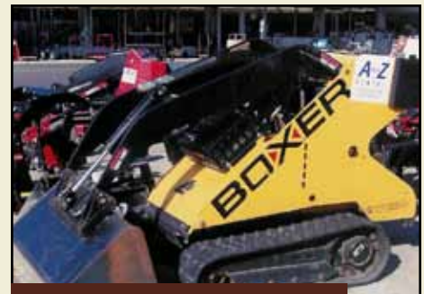
Boxer TF225 Skidsteer Loader