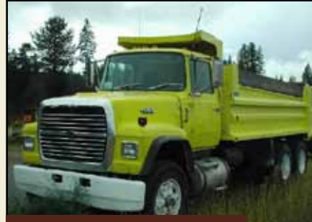
Ford L8000 TA Dump Truck