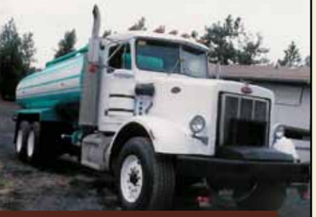
Peterbilt 4000 Gallon Water Truck