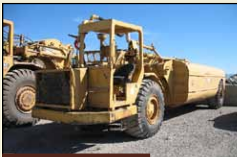
Cat 613B Water Wagon