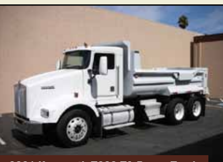
2001 Kenworth T800 TA Dump Truck