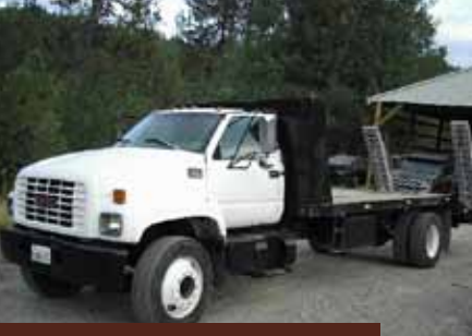
1997 GMC C6500 Ramp Truck