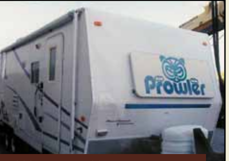
2001 Prowler 29 Ft. Travel Trailer