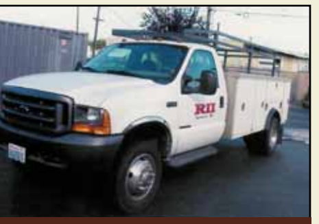
2004 Ford F450 with Service Body