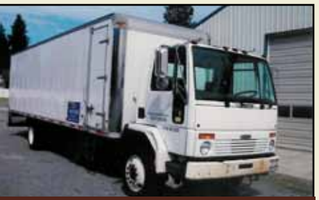
1999 Freightliner FT70 25 Ft. Refrigerated Van