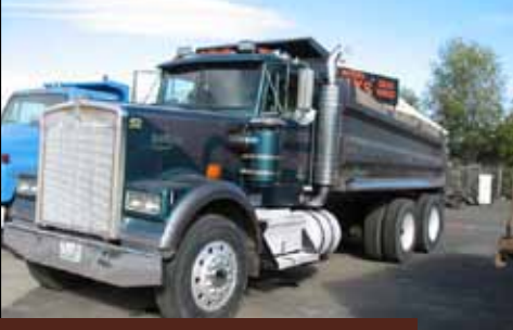
Kenworth W900 TA Dump Truck