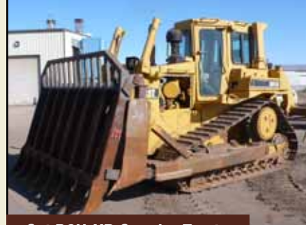
Cat D6H-XR Crawler Tractor