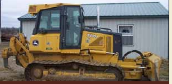
2006 John Deere 700J Crawler Tractor (Low Hrs.)