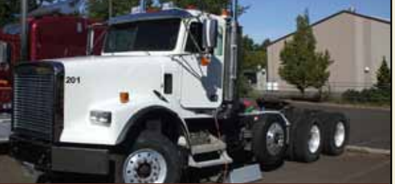
2006 Freightliner FLD120SD Tri-Axle Tractor (16,000 Original Miles)