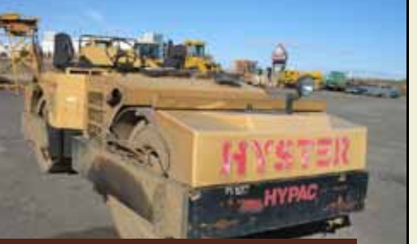
Hyster C766B Tandem Smooth Drum Roller