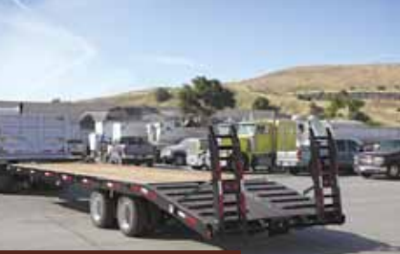
2009 Western 20 Ton Equipment Trailer