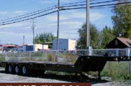
(1 of 2) Trailking 3-Axle Hyd Beaver Trailers