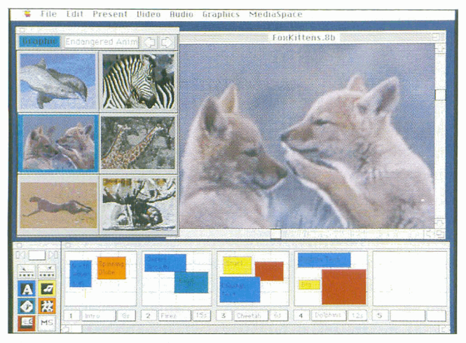
Figure 1. The Media Space interface for multimedia database browsing.

He Luit Present ludeo Budio Graphics Mediaspace Pour For For Track Direshe Sound Antm Visio Direshe Direshe Direshe Direshe Direshe Direshe Direshe Direshe Direshe Direshe Direshe Direshe Direshe Direshe Direshe Direshe Direshe Direshe Direshe Direshe Direshe Direshe Direshe Direshe Direshe Direshe Direshe Direshe Direshe Direshe Direshe Direshe Direshe Direshe Direshe Direshe Direshe Direshe Direshe Direshe Direshe Direshe Direshe Direshe Direshe Direshe Direshe Direshe Direshe Direshe Direshe Direshe Direshe Direshe Direshe Direshe Direshe Direshe Direshe Direshe Direshe Direshe Direshe Direshe Direshe Direshe Direshe Direshe Direshe Direshe Direshe Direshe Direshe Direshe Direshe Direshe Direshe Direshe Direshe Direshe Direshe Direshe Direshe Direshe Direshe Direshe Direshe Direshe Direshe Direshe Direshe Direshe Direshe Direshe Direshe Direshe Direshe Direshe Direshe Direshe Direshe Direshe Direshe Direshe Direshe Direshe Direshe Direshe Direshe Direshe Direshe Direshe Direshe Direshe Direshe Direshe Direshe Direshe Direshe Direshe Direshe Direshe Direshe Direshe Direshe Direshe Direshe Direshe Direshe Direshe Direshe Direshe Direshe Direshe Direshe Direshe Direshe Direshe Direshe Direshe Direshe Direshe Direshe Direshe Direshe Direshe Direshe Direshe Direshe Direshe Direshe Direshe Direshe Direshe Direshe Direshe Direshe Direshe Direshe