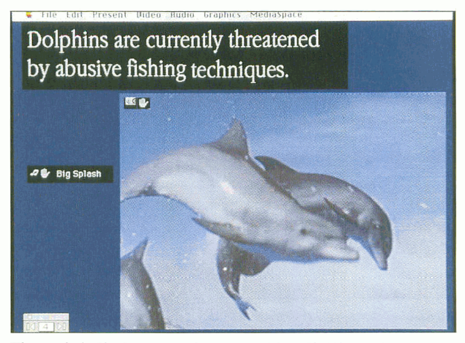
Figure 4. A display scene from a Multimedia Works document, with play icons for the sound and video elements of that scene.

tools from a menu within the Composer and then import the media files produced into their composition.