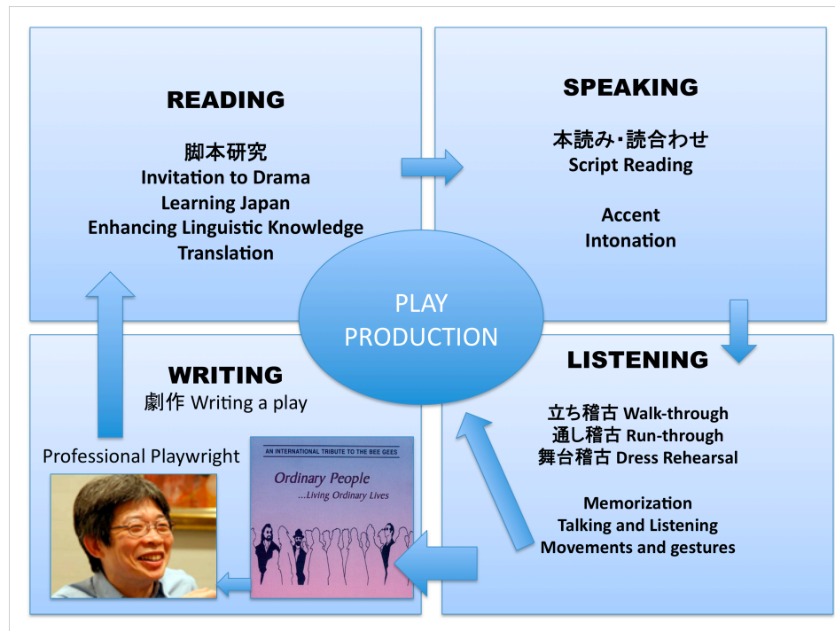
Figure 1. Play Production Process and the Four Language Skills

patterns normally found in a grammar textbook. Hirata's plays, as discussed above, are full of strategies commonly used in oral communication—abbreviation of the subjects, colloquial linguistic cues (such as tags, tails, inversions, word order confusion), and many examples of “grammar as choice,” interpersonally created in spoken language (Carter, Hughes, & McCarthy, 1998, p. 71-3). To sum up, producing Hirata's play in a language classroom in a Japanese language classroom, as in Figure 1, enhances the four skills of language, speaking, listening and reading and writing.