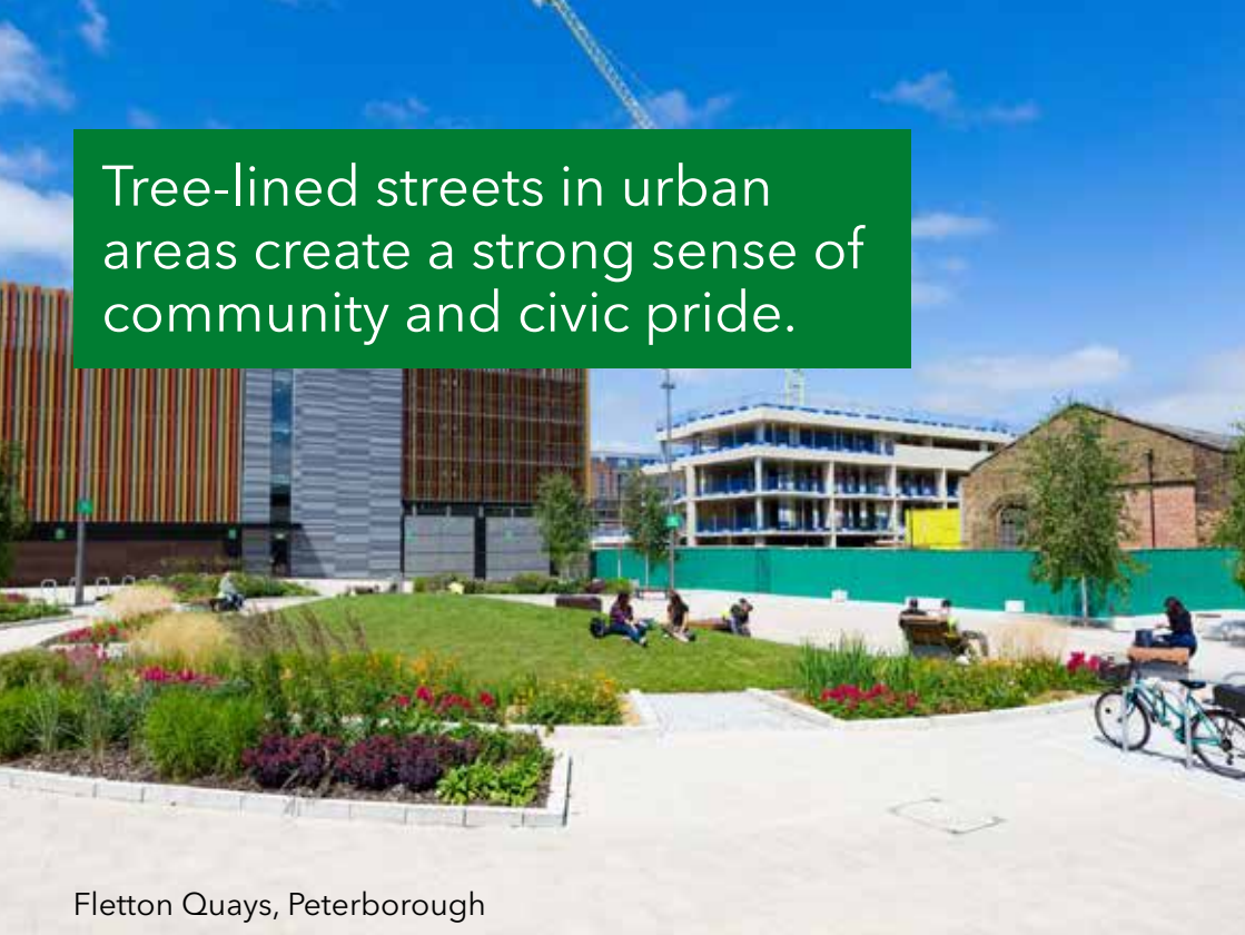
Fletton Quays, Peterborough

Tree-lined streets in urban areas create a strong sense of community and civic pride.