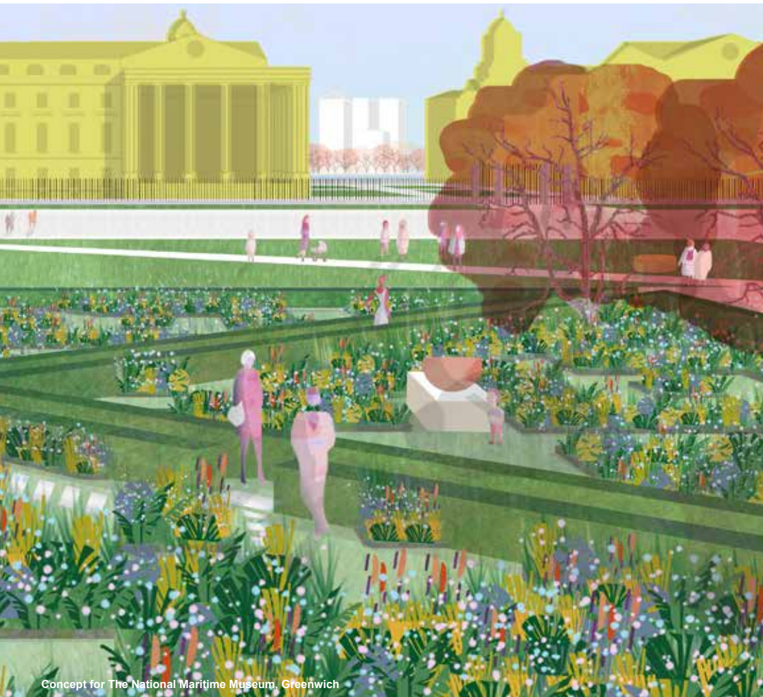
Concept for The National Maritime Museum, Greenwich

We care about health and wellbeing, social inclusion, climate resilience, heritage and sustainably-managed multifunctional landscapes... and have done since our very first project over fifty years ago.