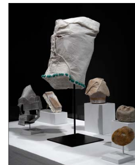
Objects in “From Afar It Is an Island”.

Kayla Romberger’s project, “100 Ways to Avoid Dying,” traces the material culture of paranoia. Responding to the underlying structures of the archaeological museum and its framework of excavation, documentation, and display, this site-specific installation exhibits the