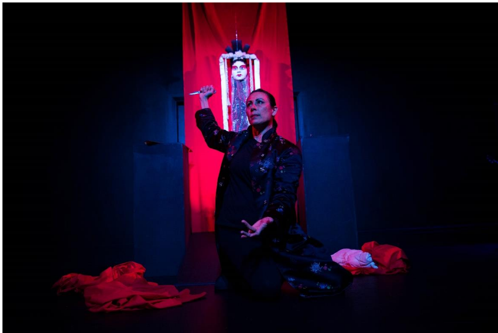
LX State for Ka Shue Ghost character