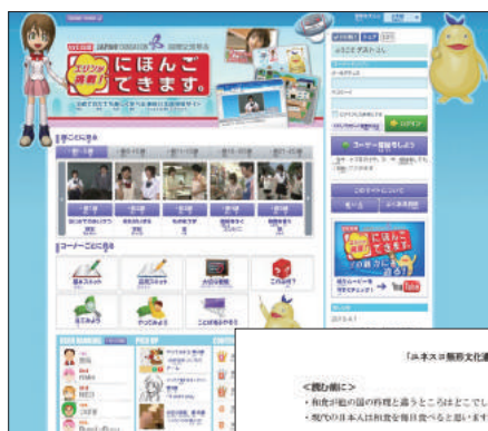
Erin's Challenge! I can speak Japanese. website

The Minna no Kyozaï website has been assisting Japanese-language teachers for 12 years. During fiscal 2014, in response to users' demands, more photos, illustrations, and reading comprehension materials were added, making the site even more useful.