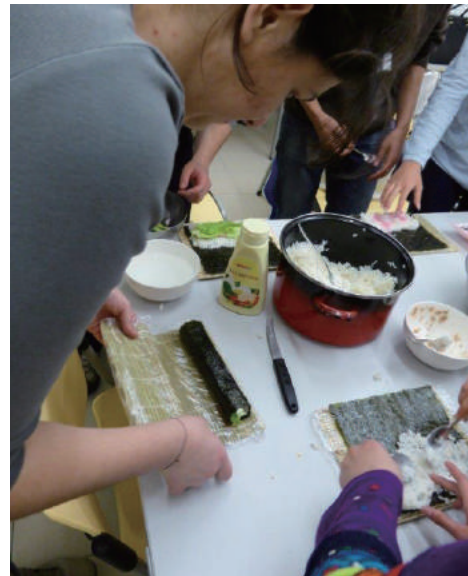
Cultural Japanese course's hands-on Japanese cooking event in Budapest

For example in Paris, the Japanese Culture Atelier covered kanji characters, Noh plays, movies, and other specific themes. Also, "NIHONGO Shaberon" was a Japanese conversation event with native Japanese living in Paris. In Madrid, a new Japanese conversation club called "¡Vamos a nihonguar!" was formed to hold games and cultural activities.