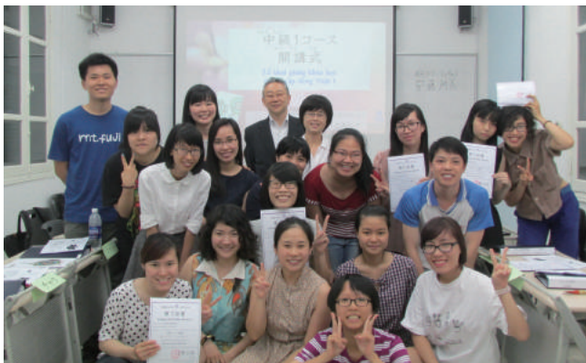
JF Language Course intermediate class in Hanoi during the opening ceremony

In fiscal 2014, over 21,000 people took the JF Language Course at the Japan Foundation's 22 overseas branches and eight Japan Centers.