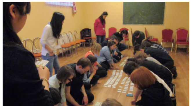
International training camp at Jagiellonian University