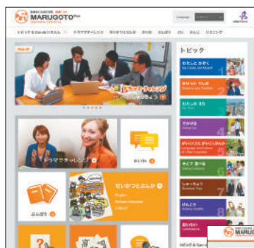
Marugoto+ Elementary 1 (A2) top page