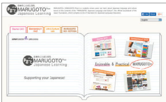
Marugoto+ (Marugoto Plus) website home page

To make it easier for people around the world to access the Marugoto+ (Marugoto Plus) website, a content delivery network (CDN) server has been employed.