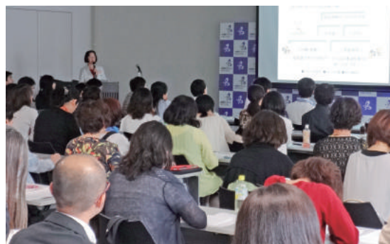
Seminar introducing Marugoto Elementary 1 (A2) in Tokyo on June 28, 2014

Japanese-language education incorporating the JF Language Course and Marugoto: Japanese-language and Culture is spreading around the world. We will continue to develop Marugoto: Japanese-language and Culture so we can publish Pre-intermediate (A2/B1) and Intermediate 1 and 2 (B1).