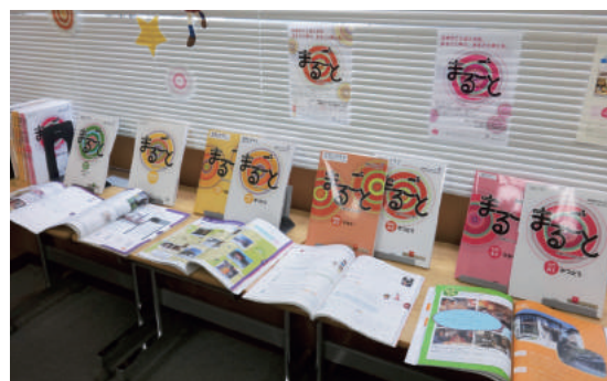
Marugoto: Japanese-language and Culture books (International Fair 2014 in Kita-Urawa.)