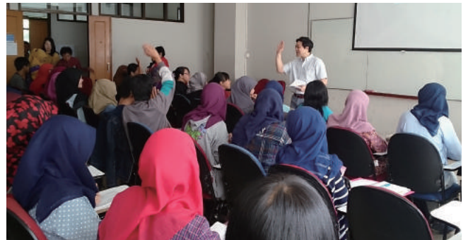
Indonesia University of Education

The pre-training program taught Japanese-language (basic grammar, vocabulary, and conversation) and the basics about Japanese society and customs. After the trainees arrived in Japan and started working at hospitals and nursing facilities, they had to continue studying to pass the national examination in their respective fields. Therefore, effective self-study habits were essential for them. The pre-training program helped them study on their own with limited time. Participants learned how to plan, review, and evaluate their own course of self-study in the program.