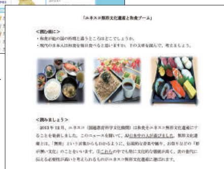
Minna no Kyozaï website: new reading material, "Nihon dewa Ima"