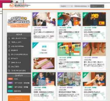
Marugoto+ Elementary 1 (A2) Life & Culture