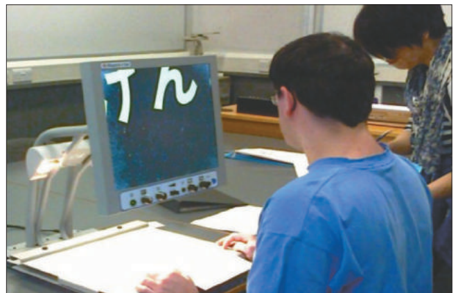
Test taker using a CCTV to magnify the test sheet