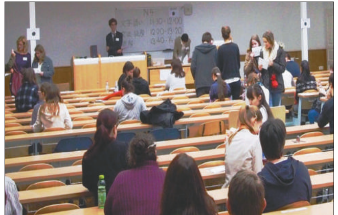
Waiting for the test to start in Budapest

In accordance with Japan's Economic Partnership Agreements (EPA), nurse and care-worker candidates from Indonesia and the Philippines are required to attain the N5 level. Those from Vietnam need the N3 level. N1 certification holders are awarded 15 points by the Immigration Bureau of Japan in accordance with the Points-based System for Highly Skilled Foreign Professionals . The N1 certification is also a prerequisite for taking the Ministry of Health, Labour and Welfare's National Medical Practitioners Qualifying Examination and practical nurse exam.