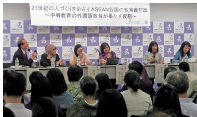
Japanese-Language Institute's 25th anniversary symposium Preparing Students for the 21st Century: The Front Line of Education in ASEAN Member States

The Japan Foundation Japanese-Language Institute, Kansai is also expanding training programs conducted on consignment. One example was the training session in fiscal 2014 for students from King Saud University in Saudi Arabia. A Japanese-language training session for King Saud University students visiting Japan was held for the first time. This training session was sponsored by Mitsubishi Corporation's donation to the university.