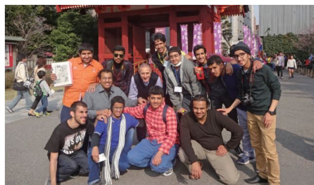
Japanese-language trainees from King Saud University visiting Asakusa