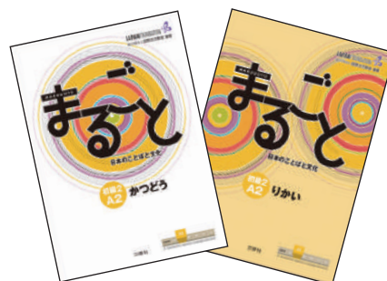
Marugoto: Japanese-language and Culture (Elementary 2 (A2) - coursebook for communicative language activities: Katsudo / coursebook for communicative language competences: Rikai)