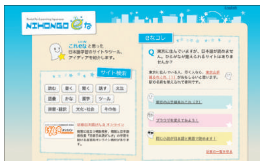
NIHONGO-e-NA home page

NIHONGO-e-NA is a useful portal for learning Japanese and deepening your understanding of Japanese culture. In fiscal 2014, we continued to provide information through the PC website and iOS and Android apps. As a result, the number of users have been increasing. The PC site has 253 articles, while the apps have 44. Japanese-language learners around the world are using NIHONGO-e-NA.