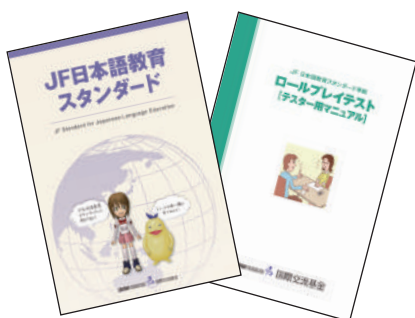
JF Standard pamphlet and Role Playing Test manual