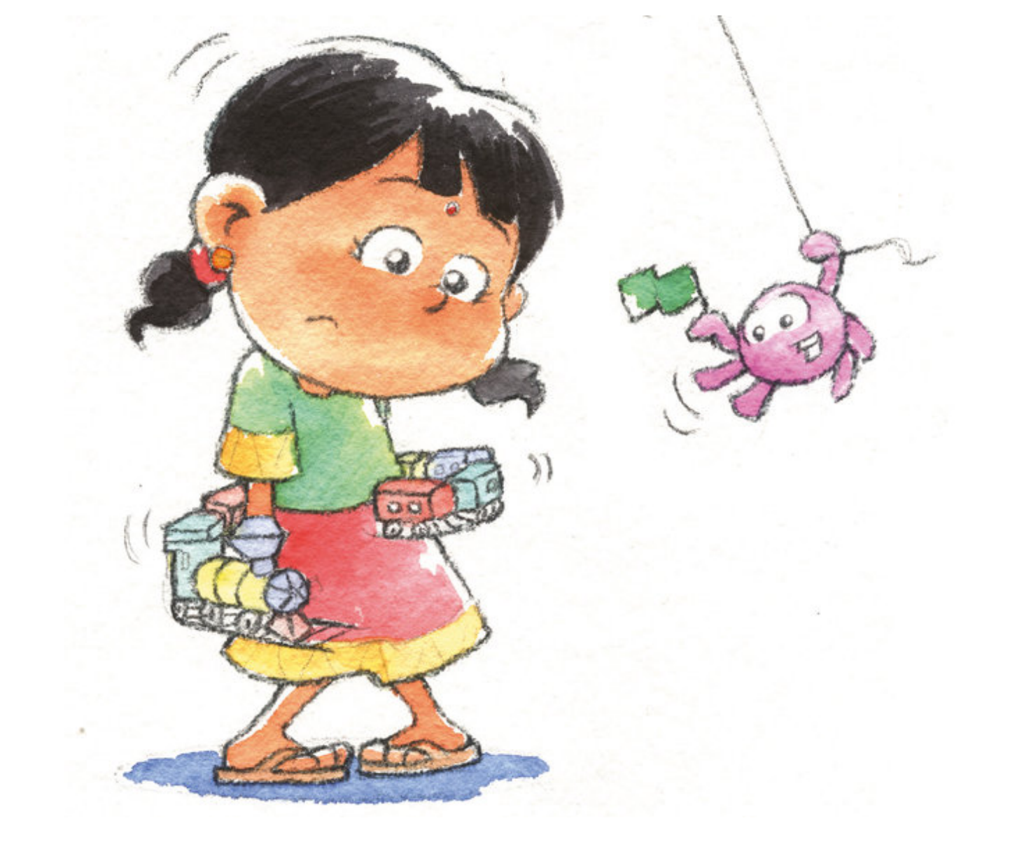
Je peux entendre mon estomac gargouiller. Gargl argl gggaarrgl garrrgggllll