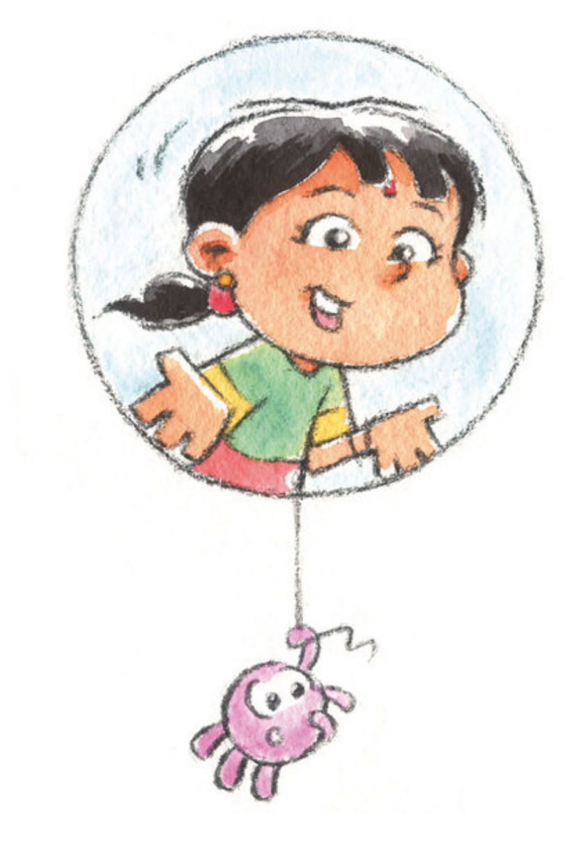
Mais...qu'est-ce que je vais faire?