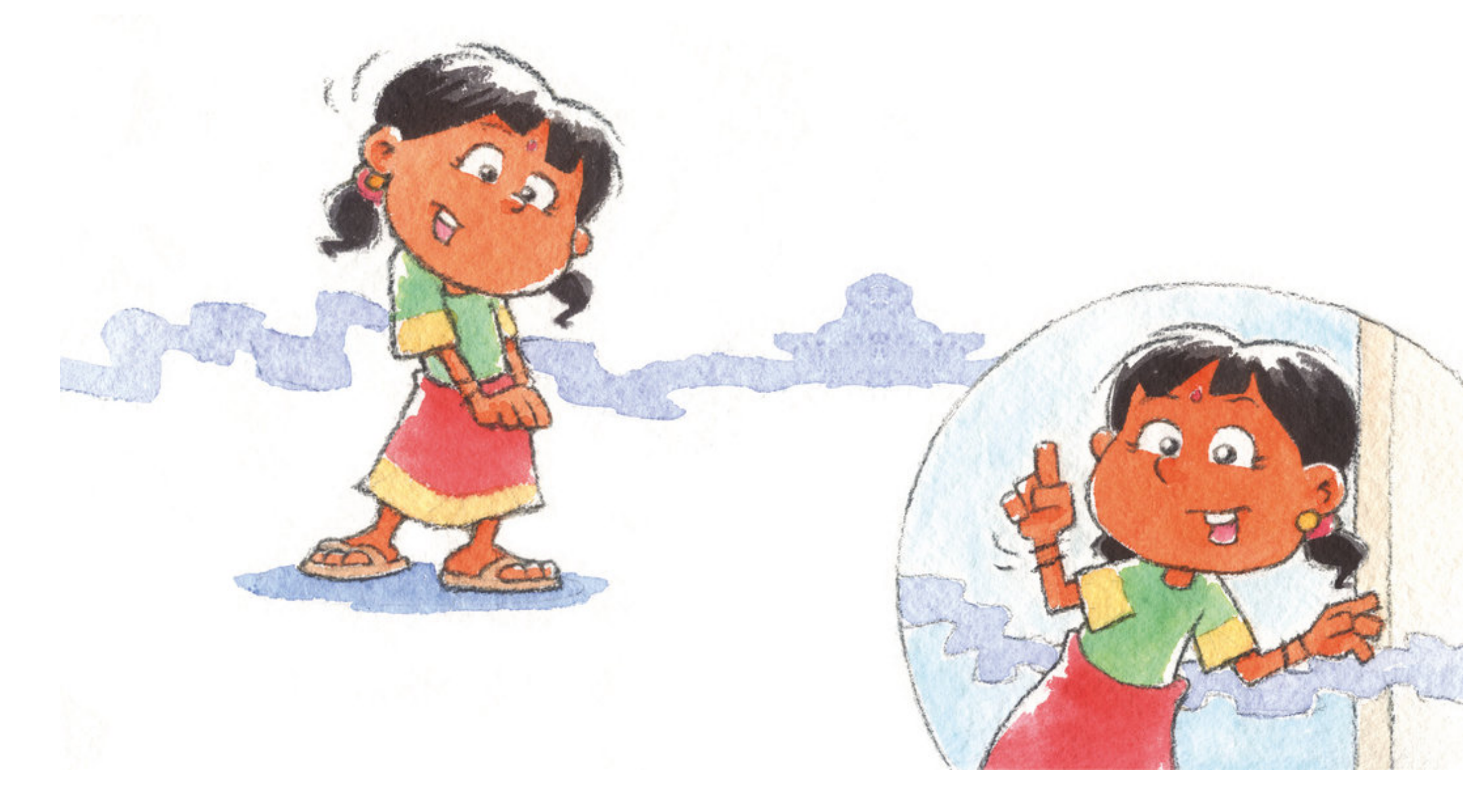
C'est amusant d'écouter mon corps. Maintenant, je peux entendre ma bouche mâcher.