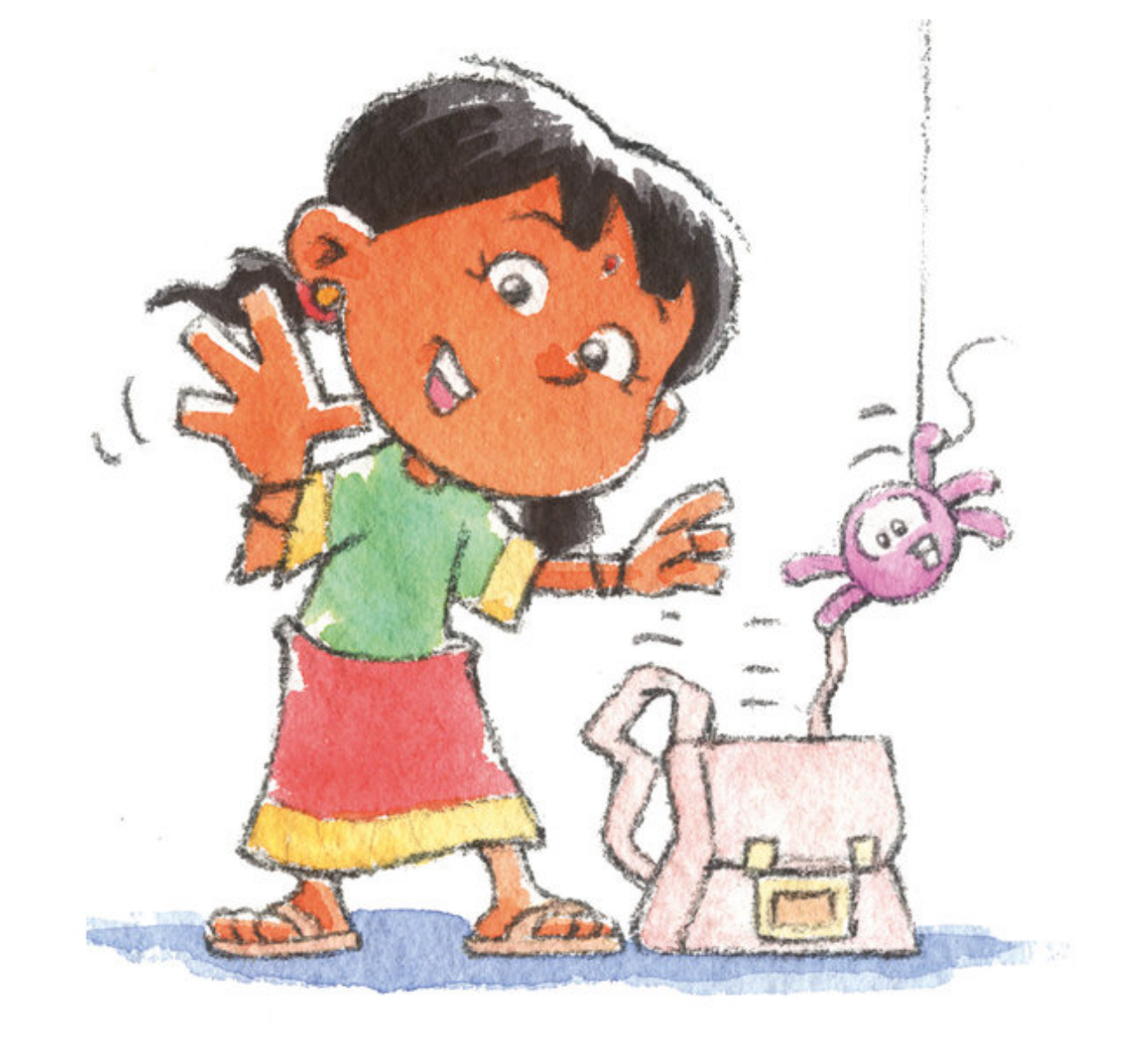
Aujourd'hui, je ne vais pas à l'école.