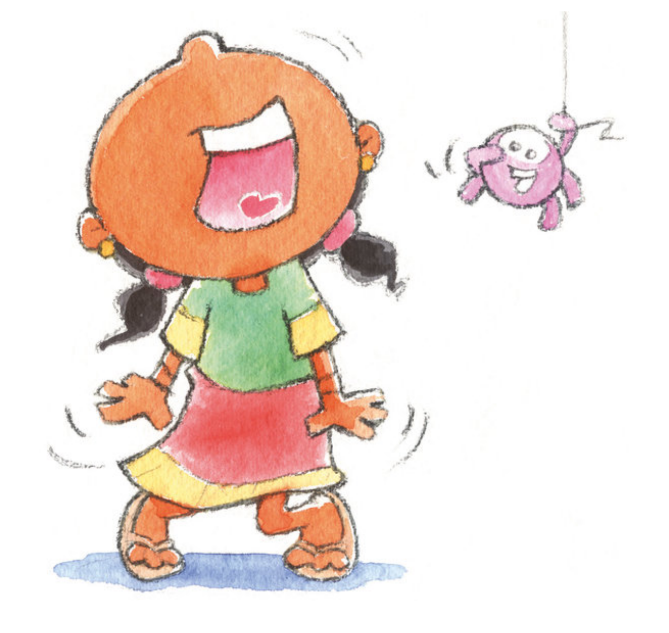
Puis, je peux m'entendre rire... Ah ah ah ah ah ah ah ah ah hhhh!