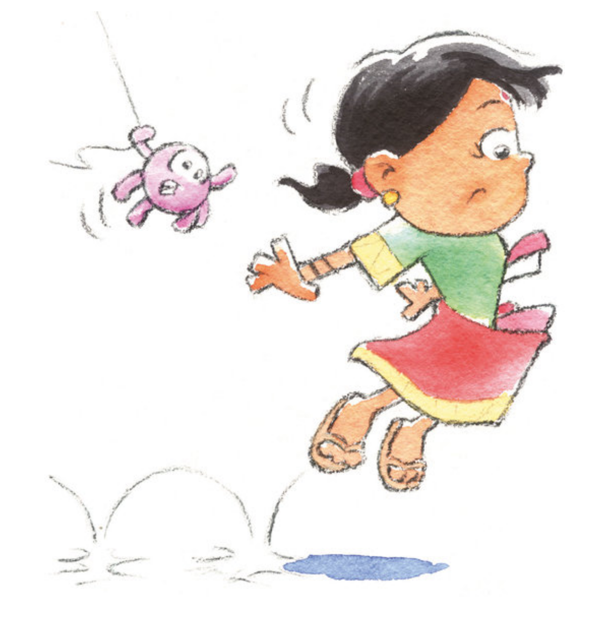
On dirait qu'il crie: "J'ai faim!"