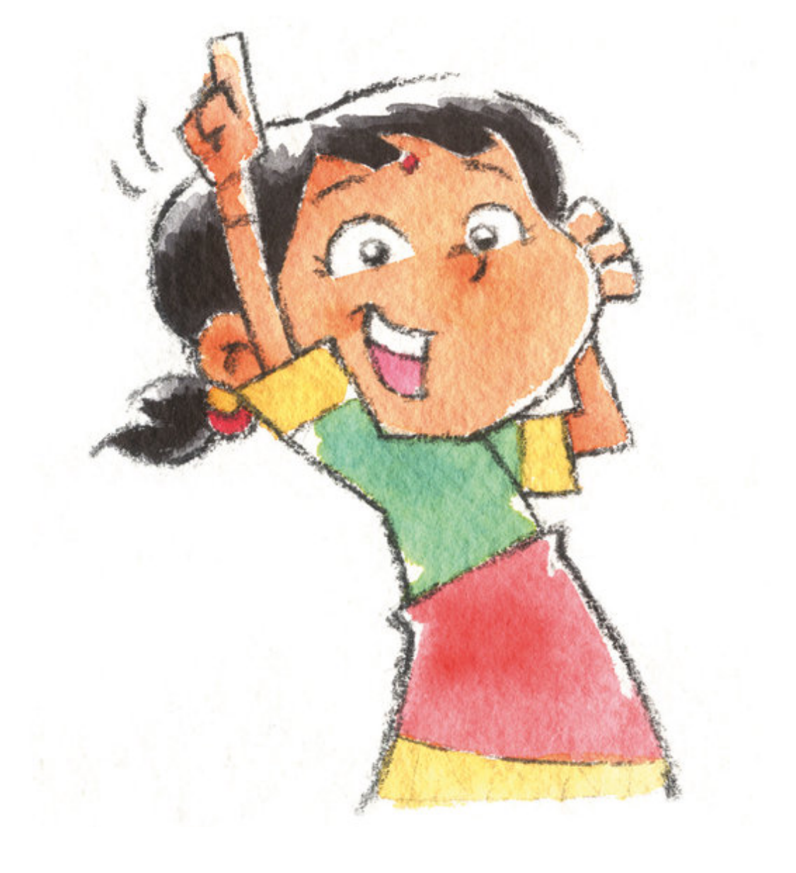
Aujourd'hui, je vais écouter mon corps.