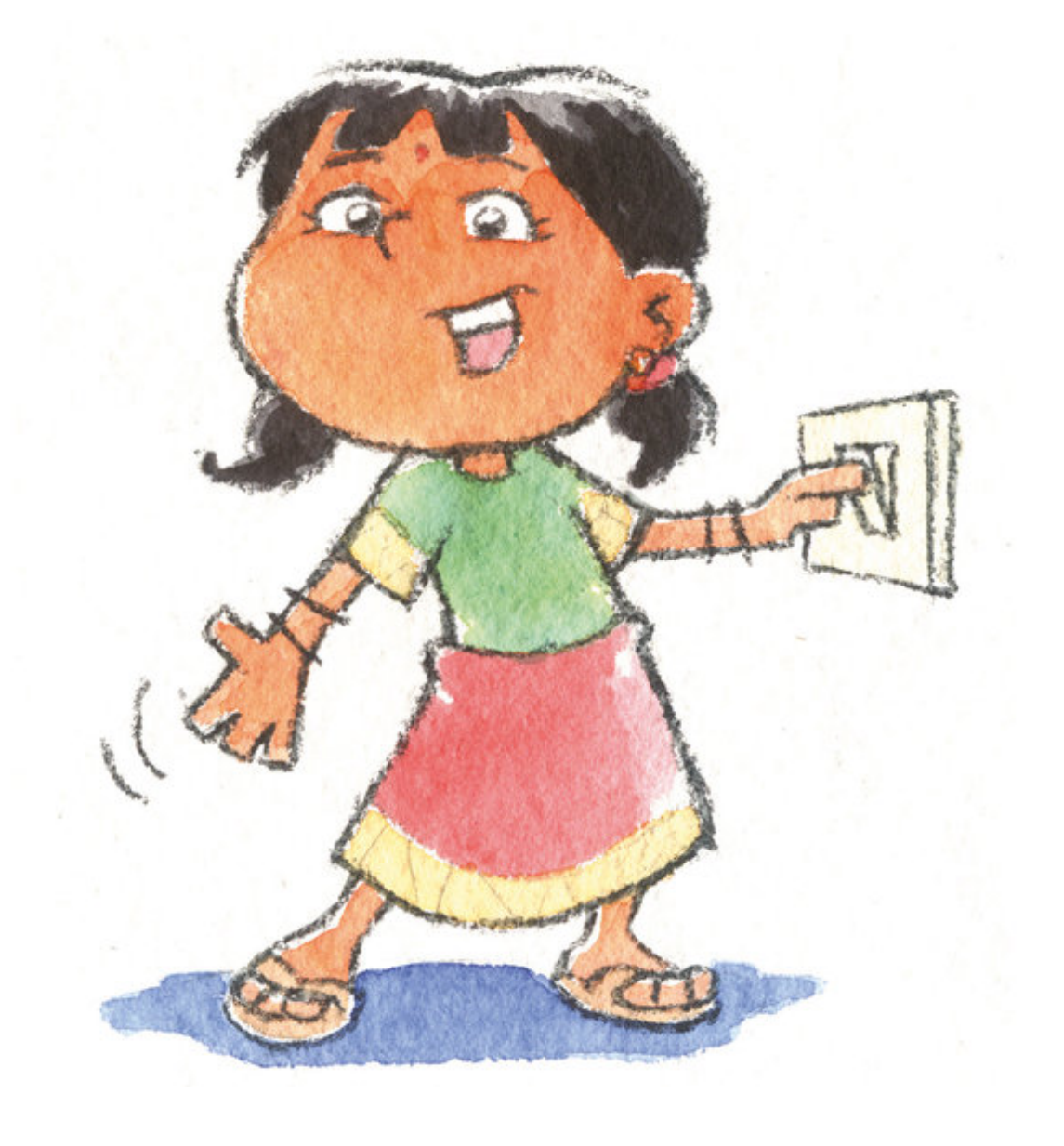
Il n'y a pas d'électricité de toute façon.