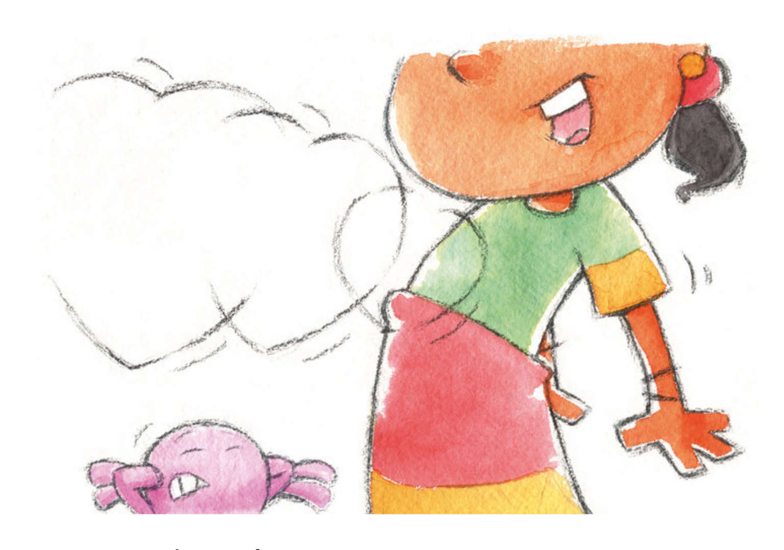
Regarde, mon cœur bat très vite maintenant. Bouboum, bouboum, bouboum...