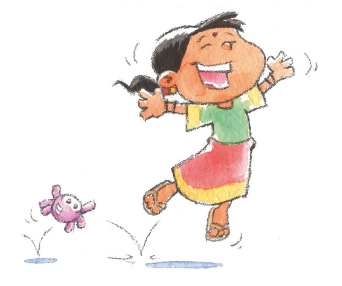
C'est une journée de congé.