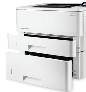
HP LaserJet Pro M402dn with optional 550-sheet tray