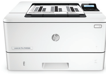
HP LaserJet Pro M402dn

Printing performance and robust security built for how you work. This capable printer finishes jobs faster and delivers comprehensive security to guard against threats. 1 Original HP Toner cartridges with JetIntelligence give you more pages. 2