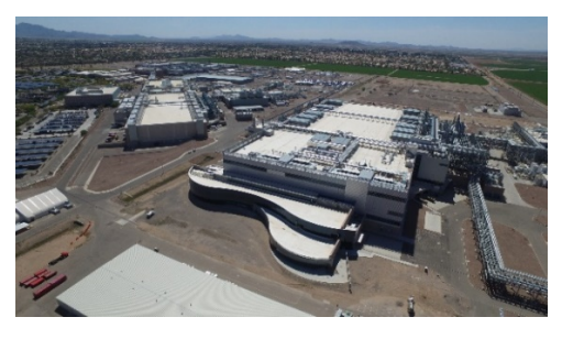
Intel's Ocotillo campus in Chandler, Arizona

Solutions: IFS will offer an unmatched combination of leading-edge packaging and process technology, a world-class IP portfolio including x86 cores, and silicon design support to help customers seamlessly turn silicon into solutions using industry-standard design platforms.