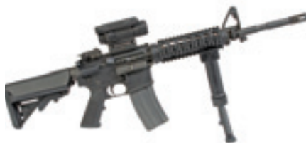
M4 5.56 mm Carbine

The M4 5.56 mm Carbine increases the lethality and operational flexibility of the soldier with a carbine-length version of the M16 rifle. Designed for lightness, speed, mobility and firepower, the M4 carbine replaces the M3 submachine gun, select M9 pistols and M16 rifles for operators who require a more compact weapon system. The weapon allows mounting of the latest generation of fire-control accessories with-