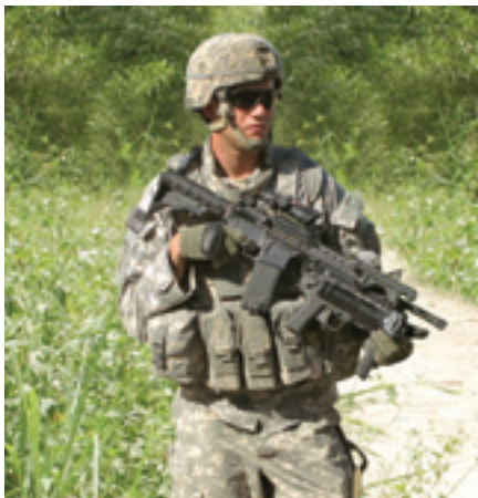
M320 Grenade launcher

The M320 Grenade Launcher enables soldiers to accurately engage the enemy in daylight or total darkness with 40 mm low-velocity grenades. The M320 will replace all M203 series grenade launchers mounted on the M16/M4 series of rifles and carbines. The weapon has a side-loading unrestricted breech that allows the system to fire longer 40 mm projectiles (NATO standard and non-