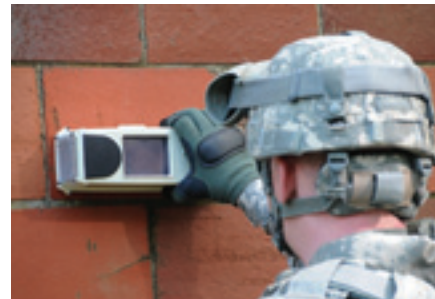
Soldier-borne sense through the wall (STTW)

Soldier-borne Sense Through the Wall (STTW) provides soldiers with the capability to detect, locate and "sense" person-