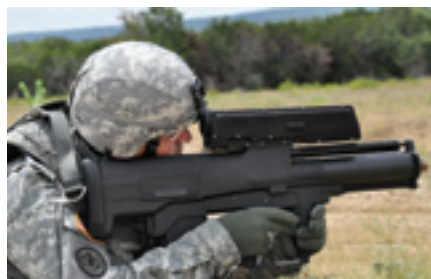
XM25 Counter defilade target engagement system (CDTE)

The XM25 Counter Defilade Target Engagement System (CDTE) is the Army's latest developmental weapon designed to address the problem of defeating enemies