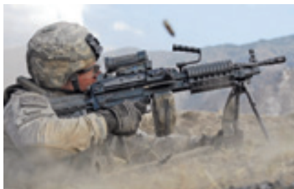
M249 Squad automatic weapon (SAW)

The XM806 Lightweight .50-Caliber Machine Gun is a lightweight variant of the M2 .50-caliber machine gun. Weighing less than 70 pounds with tripod, the XM806 weighs approximately half as much as a similarly configured M2 and reduces the recoil by at least 60 percent. This lighter weight permits easy dismount and ground transportability when necessary, and the reduced recoil permits the mounting of an optic for greater lethality through increased first-burst accuracy and control. The XM806 can fire all of the .50-caliber ammunition in the current inventory and is capable of defeating personnel and lightly armored targets out to 2,000 meters. It is designed to augment the M2 .50-caliber machine gun but can also be used to replace the M2 in select operational locations.