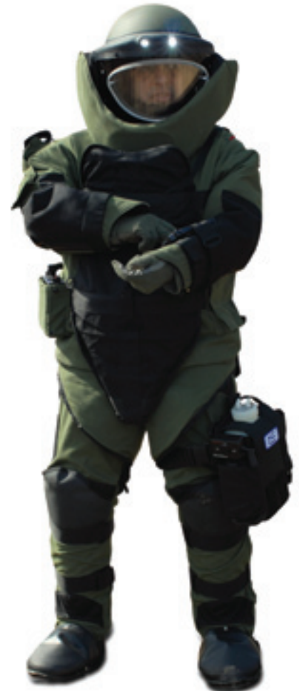
Advanced bomb suit (ABS)

The Helmet Sensor (HS) is a small, lightweight, low-power sensor suite that mounts to the advanced combat helmet or the combat vehicle crew-member helmet. The helmet sensor detects, measures, and records impact accelerations and blast overpressure associated with improvised explosive devices (IED) and other high-energy events that may cause concussions in an operational environment. The Army is analyzing data collected from nearly 7,000 helmet sensors deployed to Operation Iraqi Freedom and Operation Enduring Freedom. The sensors continuously and automatically collected data, recording peak overpressure from IED blasts, crashes, blunt impact and ballistic events. The helmet sensor program is continuing with a second-generation helmet sensor that expands the data gathered and introduces wireless capability as well as other functional improvements. The data gathered by the two gener-