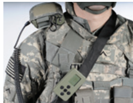
Gunfire detection systems (GFDS)

Gunfire Detection Systems (GFDS) are lightweight soldier-wearable sensors that accurately locate and engage enemy snip-