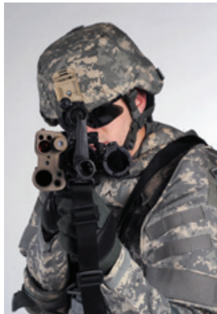
AN/PSQ-23 small tactical optical rifle mounted (STORM) micro-laser rangefinder (MLRF)

The TWS Head Mounted Display (HMD) integrates with the AN/PAS-13 TWS to provide a remote viewing capability for TWS and vehicle-mounted imagery. It allows a more comfortable firing position of the TWS on the M2/MK19 weapon systems. The HMD operates on four AA batteries and weighs less than 8 ounces.