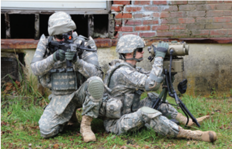
(AN/PED1) Lightweight laser designator rangefinder (LLDR)

Product Manager Soldier Precision Targeting Devices (SPTD) is the branch of PM SSL that supports the research and development of target designation systems.