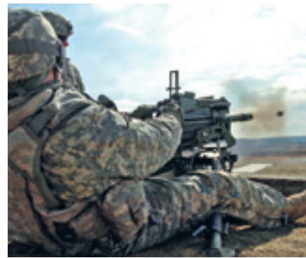
MK19 40 mm Grenade machine gun (GMG)

The MK19 40 mm Grenade Machine Gun (GMG) is an air-cooled, belt-fed, blow-back-operated, fully automatic weapon system. It has a maximum effective range of