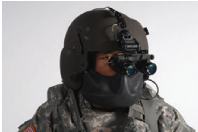
AN/AVS-6 aviator's night-vision imaging system (ANVIS)

The AN/AVS-6 Aviator's Night-Vision Imaging System (ANVIS) is a helmet-mounted, direct-view, third-generation image-intensification piloting device that enables flight operations under very low ambient light conditions. The latest version, AN/AVS-6(V)3, is capable of operating down to near-starlight conditions. The system incorporates 25 mm eye relief; dual-span adjustment knobs; gated power supply; either filmless or thin-film tube designs; fine-focus objective lens; and a low-profile battery pack. The low-light