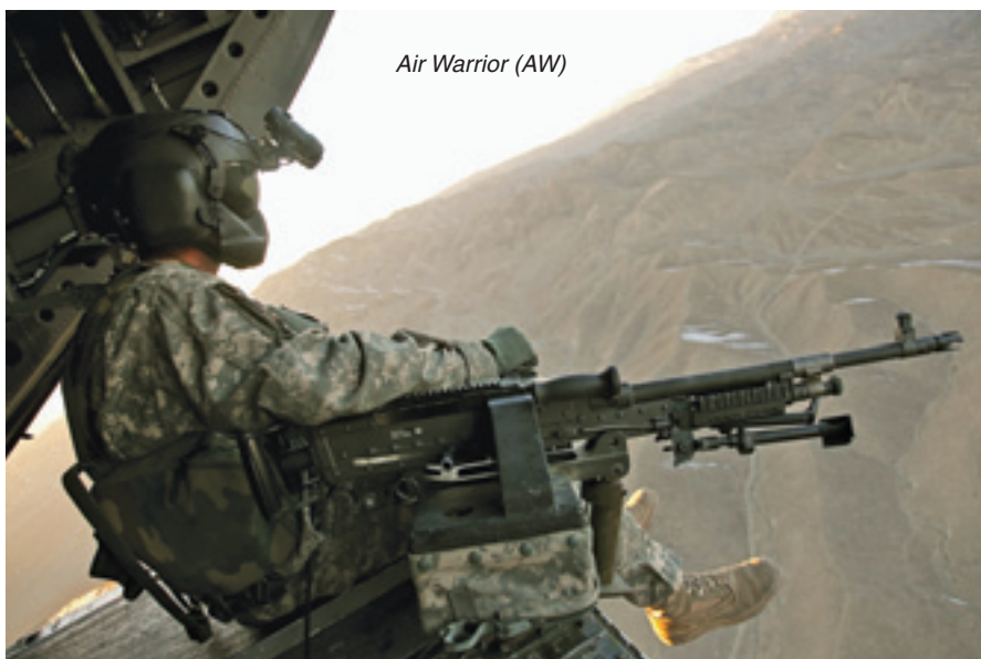
Air Warrior (AW)

The Portable Helicopter Oxygen Delivery System (PHODS) is a soldier-worn oxygen system that delivers compressed oxygen from a lightweight steel oxygen bottle via a nasal cannula up to 18,000 feet and via a mask at altitudes above 18,000 feet. PHODS uses a pulse-demand oxygen