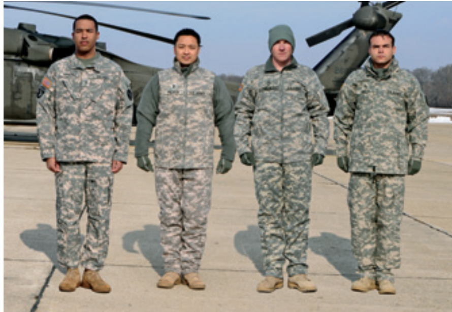
Fire resistant environmental ensemble (FREE)

Product Manager Soldier Protective Equipment (PM SPE) develops and fields state-of-the-art force-protection equipment that defeats ballistic and fragmentation threats in theater. PM SPE provides supe-