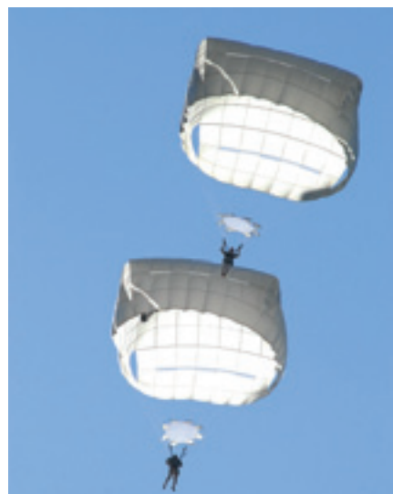
T-11 Personnel parachute system

The Generation III Extended Cold Weather Clothing System (ECWCS) is a