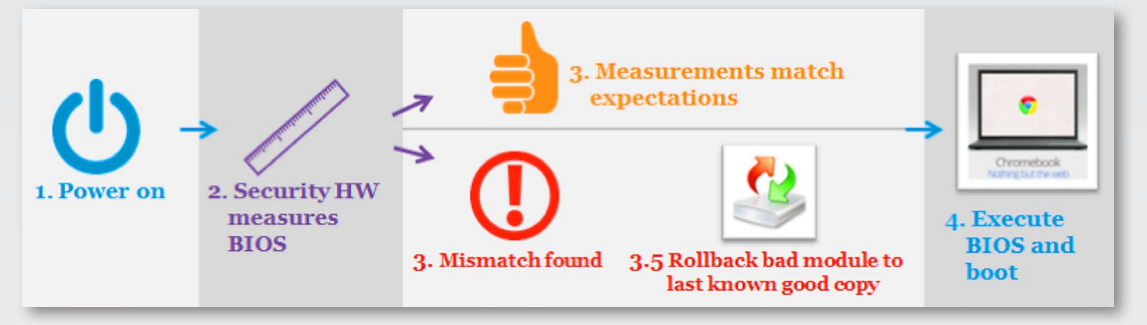
Figure 1. TPM Root of Trust Attestation on Chromebook Architecture

The Chromebook, a $250 consumer-grade netbook offered by Google and made by Samsung, among others, is one example of a consumer-oriented product that has a TPM built in. Google's process is illustrated in Figure 1.