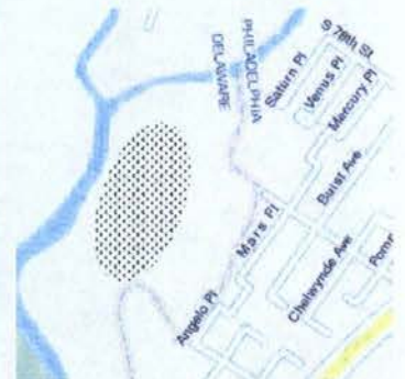
Clearview Landfill Site - Delaware Co.

For additional information, please contact Carrie