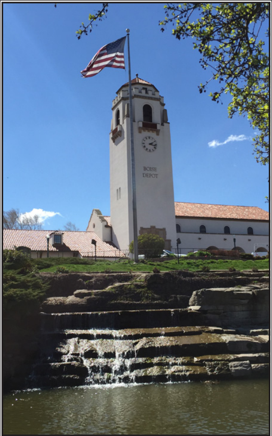
Union Pacific Mainline Depot