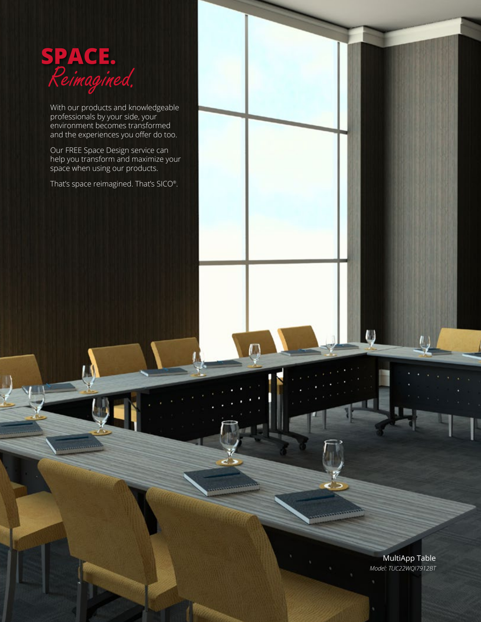
MultiApp Table Model: TUC22WQI7912BT