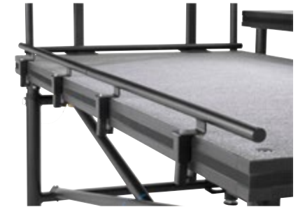
Chair & Table Stops

These rugged stops help optimize safety by ensuring tables and chairs won't slide off the stage. Made from steel bars and available in multiple lengths, they attach quickly and rest one-half inch above the surface of the stage deck.