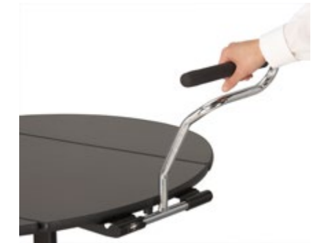
Table Guide (Optional)

Choose a larger 5" resort caster for easy rolling over rough terrain. Constructed for durability and easy cleaning. One person can easily roll and maneuver tables.