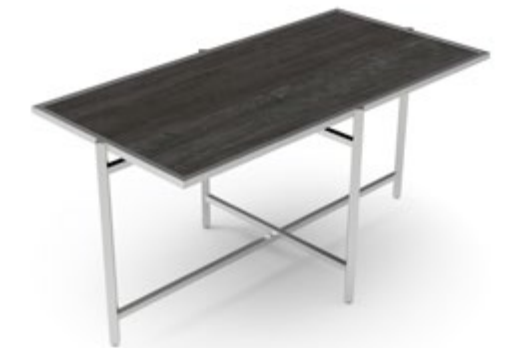
Diamond Cross Frame

Elevate your guests' experiences with our Socializer selections. Featuring tiered heights that complement a sit-down dining or standing social event, these versatile favorites maximize your serving flexibility.