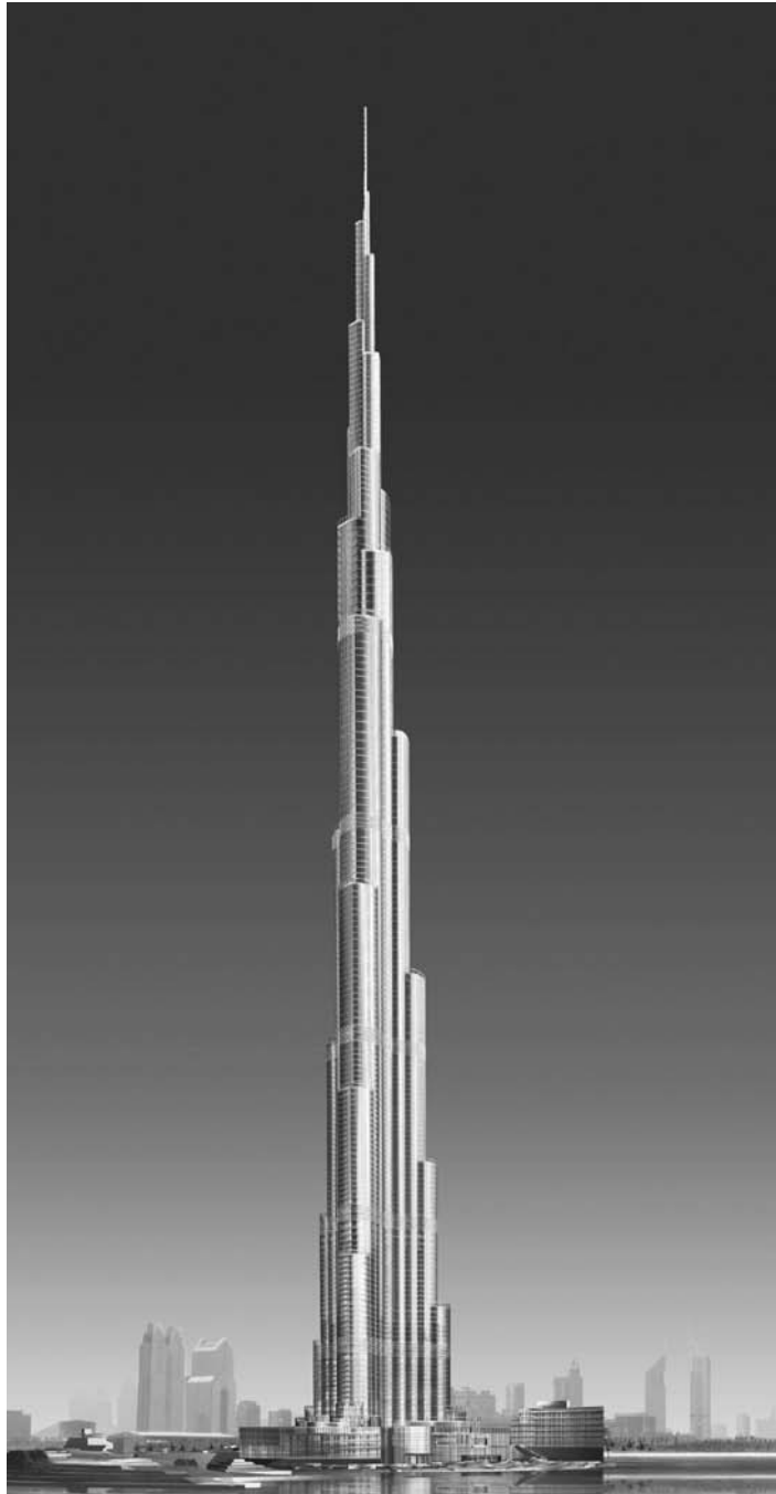
FIGURE 1-7 Burj Dubai. The world’s tallest structure located in Dubai, United Arab Emirates (UAE).

Leaving aside the belief that “mankind’s aspiration to reach the sky, the ‘Tower of Babel Complex,’ drives us to erect higher and higher buildings,” 35 there are many other reasons why tall buildings are given