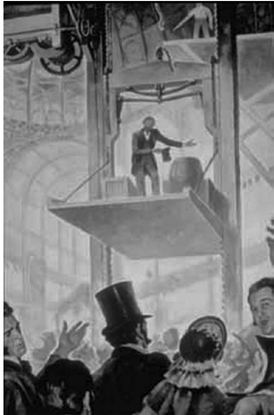
FIGURE 1–1 Otis Publicly Demonstrates the World’s First Safety Elevator. In 1854, Elisha Graves Otis at the Crystal Palace Exposition in New York City dramatically cuts the cable and the platform does not plummet down.

Steel frames were able to carry the weight of more floors, so walls became simply cladding for the purpose of insulating and adorning the building. This development, which included applying hollow clay tiles to the steel supports, resulted in a fireproof ◆◆ steel skeleton and