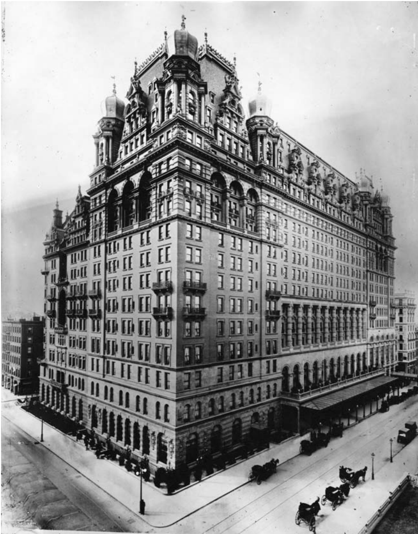
FIGURE 1-4 Waldorf-Astoria Hotel. This sprawling hotel was an 1898 combination of the Waldorf and Astoria hotels (1891–1893 and 1895–1897) in New York City.

An example of a hotel of this era was the Waldorf-Astoria (Figure 1-4) in New York City.