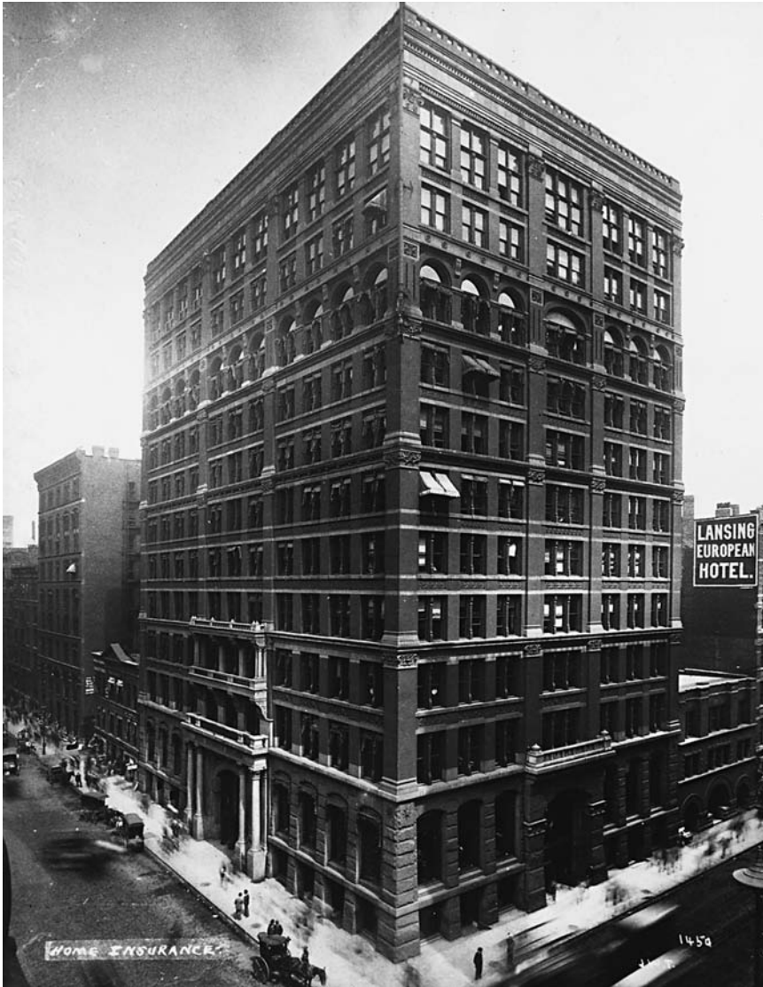
FIGURE 1-3 Home Insurance Building 1885. This 10-story building, designed by engineer William Le Baron Jenney, is generally considered the world's first skyscraper. It was built in Chicago in 1885, using a steel frame. It was demolished in 1931. The ABN AMRO office building now stands on this site.

directories listed 183 in 1895, and by 1912 there were 222 that had fifty rooms or more. Although London and Paris had more hotel buildings, New York City could accommodate more people in its hotels than any other city in the world. 23,24