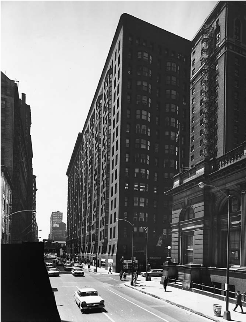
FIGURE 1–2 Monadnock Building, 1889. This 16-story building is the tallest load-bearing brick structure in the world. At their base, the building walls are six feet (1.8 meters) thick. (HB-19320-C).

“also permitted movable interior partitioning, which allowed office suites to be reconstructed to meet the demands of new tenants.” 15 “This new method of construction reduced the thickness of walls, increased valuable floor space, and because it weighed much less than masonry, allowed immense increases in height. Freed from the constraints