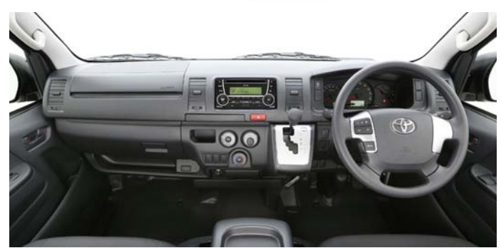
Hiace ZL driver and front passenger have an expansive view over the clean dash. The audio system includes a radio, MP3/WMA CD player, auxiliary input jack and USB connection, Bluetooth handsfree phone capability and audio streaming, voice control for audio/phone, three line text display, radio text, and two speakers.