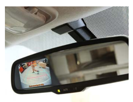
Each Hiace features a reversing camera with static guide lines and a clever colour monitor camera embedded in the rear view mirror, offering extra convenience in confined urban delivery zones and added peace of mind when reversing in residential areas.

Front seat pre-tensioners instantly tighten the seat belts at the time of a collision to help enhance occupant restraint performance. The force limiter function loosens the seat belts while maintaining the load to help mitigate the impact to the chest regions of the front seat occupants.