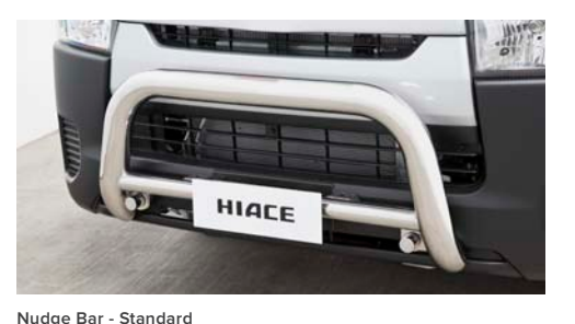
Made from stainless steel this SRS airbag compatible nudge bar has driving light mounts.

Only Toyota Genuine Accessories are designed and manufactured to the same high standard as original parts. They are engineered using manufacturer data to ensure that vehicle integrity is not compromised, meaning the functionality of important precision systems (such as airbags) will not be impaired by their installation.