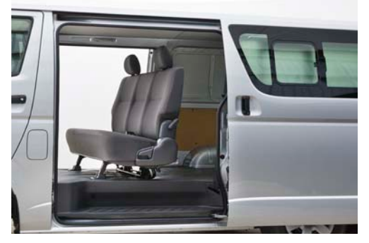
A second row seat in ZL half panel and full glass manual models provides extra seating capacity for three or can be folded for additional cargo space.