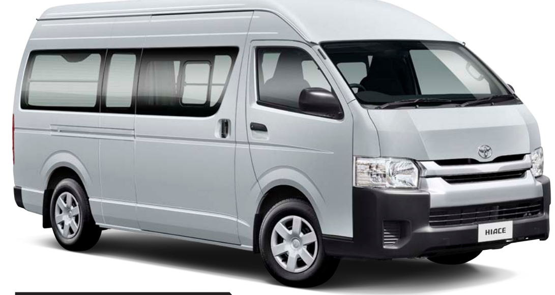
The extra width of ZX van means even more storage inside and a panoramic view of the road ahead.