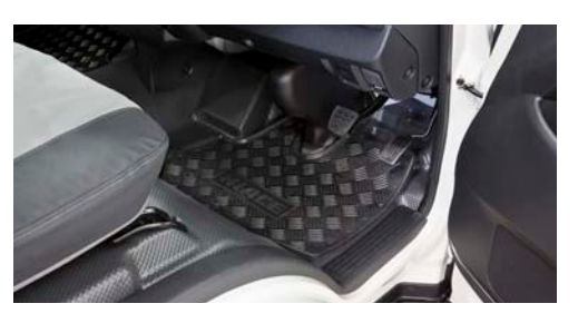
Front Floor Mats - Rubber These heavy duty rubber floor mats will protect the floor of your Hiace. Driver's side has two clips for safety.

A wide range of roof racks and load carrying accessories are available from your local Toyota Dealer.