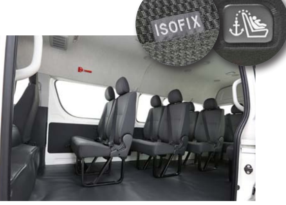
Interior comfort is paramount for happy, relaxed passengers - cool air is delivered through ceiling vents. Passengers travel in comfort and safety thanks to all seats having 3-point ELR seat belts. Hiace Minibus also features 3 x Tether Anchors and 3 x ISOFIX points.