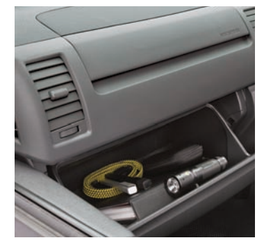
Ample covered storage helps keep the interior clutter free, preventing reflective objects interfering with visibility.