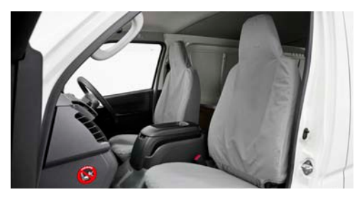
Front Seat Covers - Canvas Protect the front seats of your Hiace with these durable grey canvas seat covers.

The combination Towbar/Bullbar can safely tow 1400kg braked, 750kg unbraked. Available without step plates.