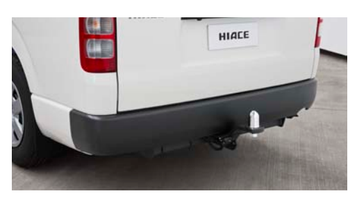
Towbar and Accessories

Safely tow 1400kg braked/700kg unbraked trailers with this fixed tongue towbar and accessories.