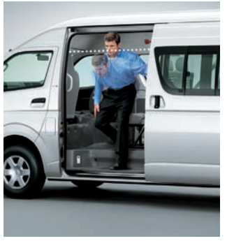
As well as having plenty of space inside, the Minibus side door has been designed with ample head room for easy entry and exit.