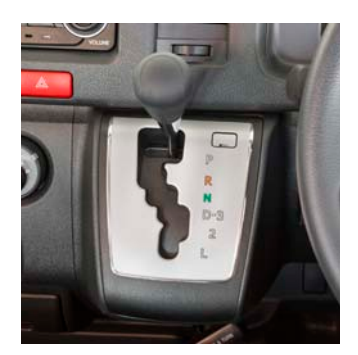
An important feature is the dash mounted gear lever that maximises interior space.