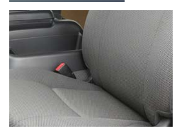
DARK GREY FABRIC