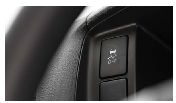
VSC (Vehicle Stability Control) helps you correct a loss of control by detecting if the vehicle is starting to skid or slide. By comparing the vehicle's direction of travel with your steering, acceleration and braking inputs it can tell if you are deviating from the intended direction. VSC then warns you, reduces engine power and controls the brakes to help you correct the situation.