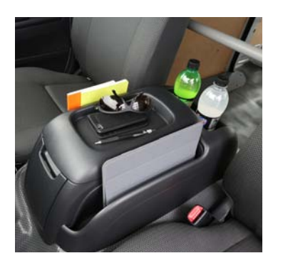
The generously sized centre console is the perfect place to manage the many items you need to access throughout the working day.

HIACE ZL FULL GLASS VAN IN FRENCH VANILLA