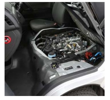
The cab forward design neatly packages the engine under the front passenger seat.