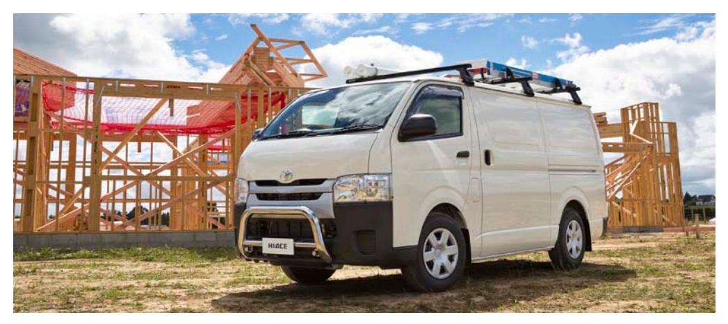
Hiace ZL full panel van shown fitted with nudge bar, weathershields, headlight protectors, rear bull bar, towbar and roofrack.