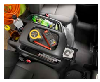
The centre console in ZX vans is the home for all the small items you need to keep close to hand.