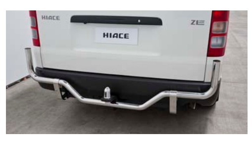
Rear Bull Bar - Stainless Steel This highly polished rear bull bar will protect the rear of your Hiace. Requires towbar; sold separately.

Nudge Bar - Deluxe This polished alloy nudge bar is SRS airbag compatible and has driving light mounts.