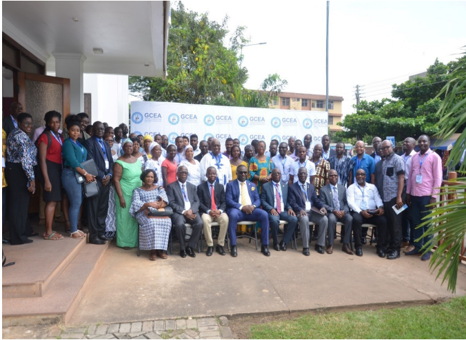
Group photograph at the Week Celebration