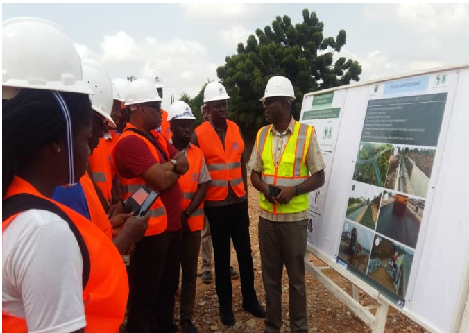
Delegates at the Pokuase Interchange under construction