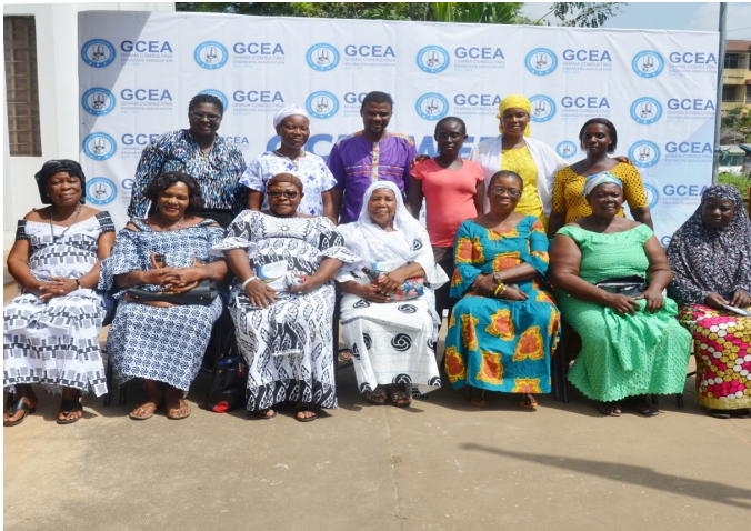
Market women invited to shed light on the sanitation situation in our markets.