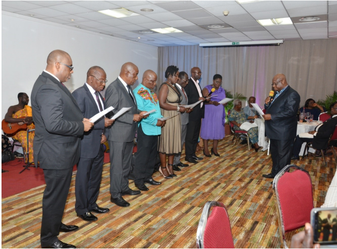
Swearing in of new Council at the dinner