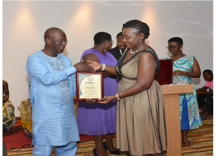
Presentation of awards to distinguished delegates