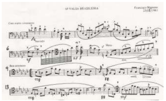
Mignone, 6<sup>a</sup> valsa brasileira for solo bassoon, FUNARTE. Rio de Janeiro. 1981.