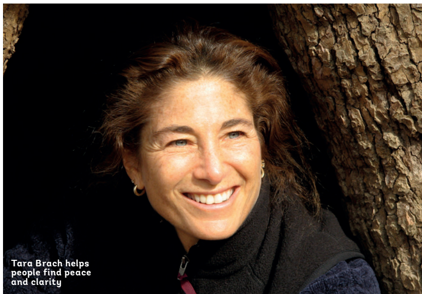
Tara Brach helps people find peace and clarity

As a young woman, she lived in a spiritual »