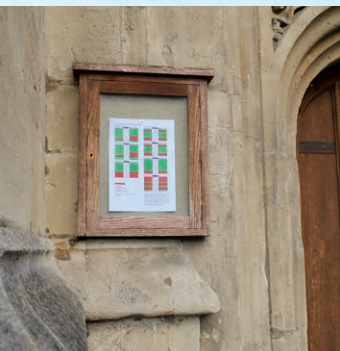
South West door

There are daily services in the Abbey, choir practices and many other events in the year. To help Street Musicians, the Abbey publishes a traffic-light system on two public noticeboards. (On the board facing the Roman Baths, and the board on the railings on the side facing Kingston Parade.) Green means it is ok to proceed with care; the red means please do not busk.