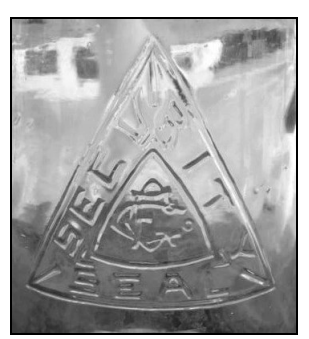
Figure 5 – Security Seal (eBay)