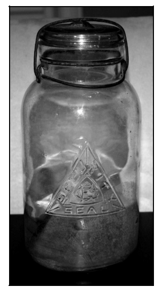
Figure 6 – Security Seal

firm than anyone we have discovered. Presumably, she had good reason for her identification. It is certainly a better choice than the Fairmount Glass Co. — which never existed — or the Fairmount Glass Works, a name that does not fit the initials. An eBay photo showed the glass lid on a Security Seal jar embossed "E-Z / SEAL" (Figure 8). Some of the bases were embossed with single-digit numbers, although others only had the valve scars (Figure 9).