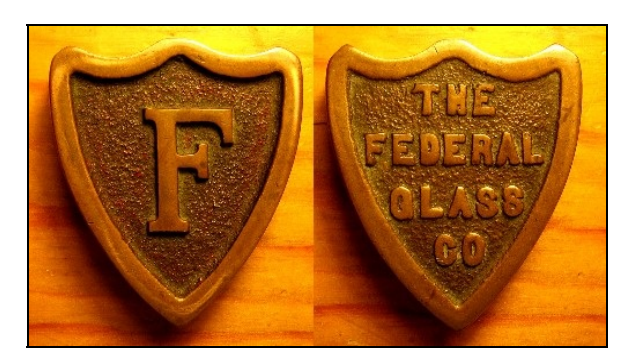
Figure 2 – Federal paperweight

Also, in 1912 (the first year individual jar types were listed), the Thomas Register showed Federal as specifically making fruit jars, and a listing under kitchen cabinet jars began in 1916. The listings ran until 1920, but the company was no longer enumerated as making jars in 1921 (1912:2727; 1916:3783; 1917:1104-4105; 1918:4430-4461; 1920:4616-4617). At some point, Federal commissioned a brass