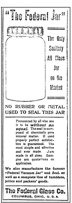
Figure 1 - 1907 Federal Jar ad (Iwen 2006:17)

The Thomas Registers listed the company as making jars from 1907 to 1909 but did not list the specific type (1907-1908:799; 1909:1101). An advertisement for "The Federal Jar," however, appeared at least as early as 1907. The Federal Glass Co. ad showed an