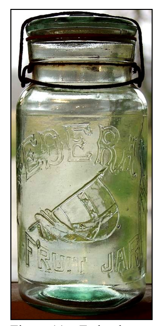
Figure 11 – Federal Fruit Jar (North American Glass)

Creswick (1987a:59), too, called it an "Australian jar." The design of the flag had a cross with stars inside the cross (four stars across and four down).