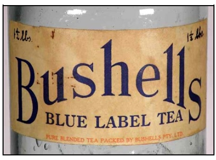
Figure 12 – Bushell's label (North American Glass)

The design on the front does not match the Australian flag, which has the Union Jack (Britain) in the corner, a federal star below, and the southern cross in the center. Nor does it match any U.S. flag. It most closely resembles the Confederate flag or the one from Mississippi (based on the Confederate flag) –