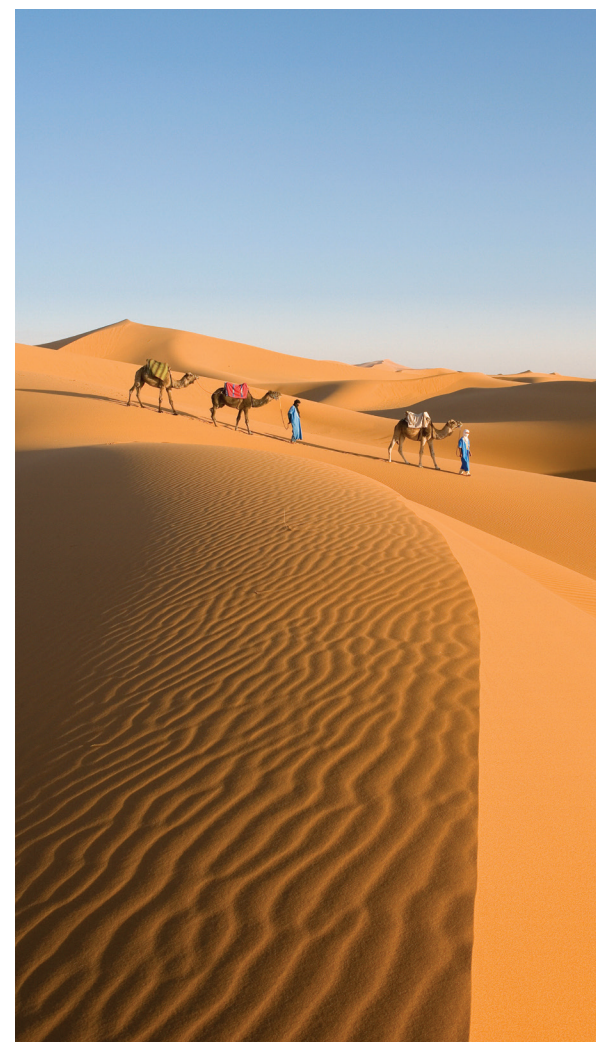
We ride camels in the Sahara on Day 8.