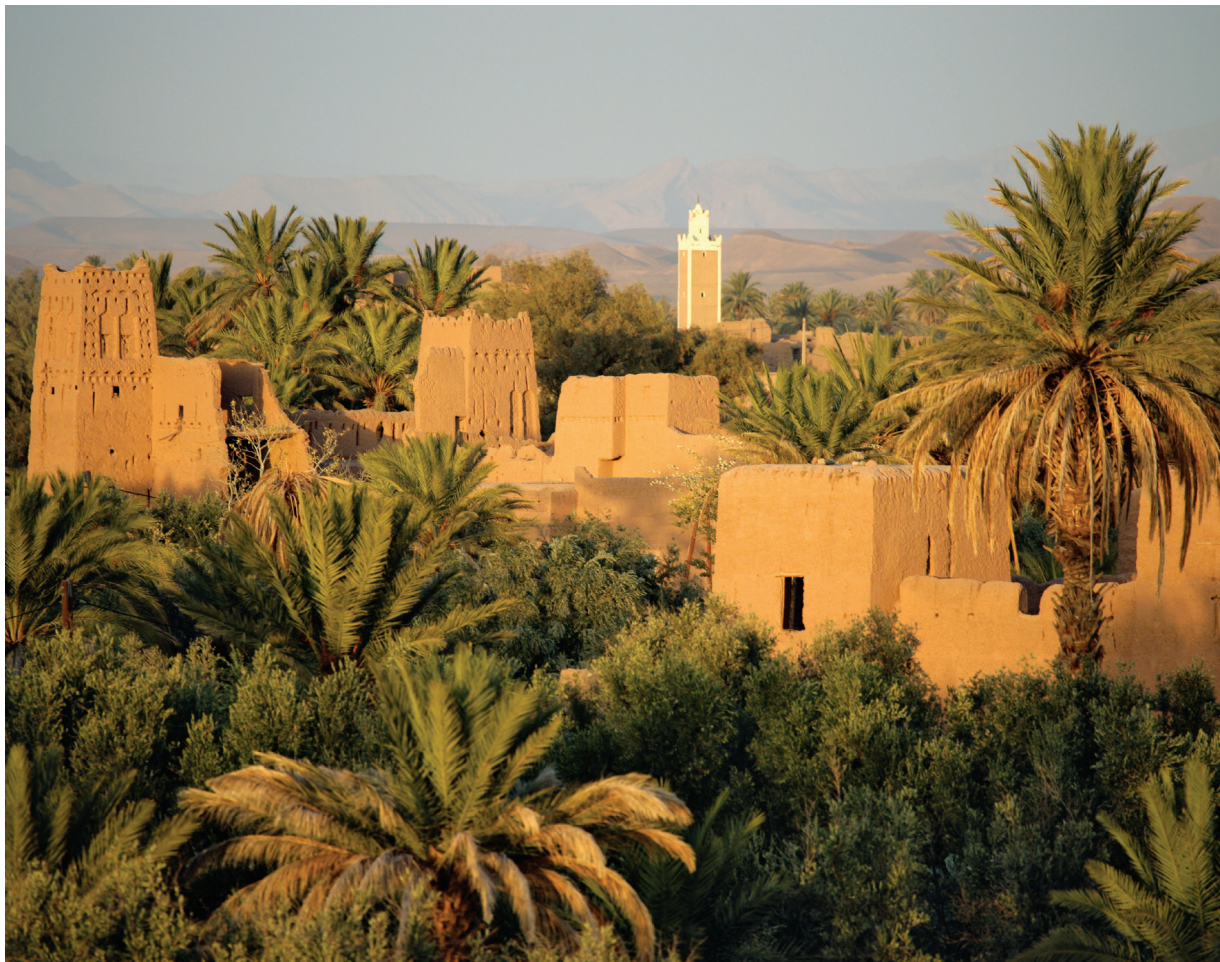
We encounter many of Morocco's age-old kasbahs on our journey.

This land of dramatic contrasts invites us to encounter its ancient ruins and sacred mosques, endless desert and storied mountains, imposing kasbahs and spirited souks. As we travel from the imperial cities of Rabat, Fez, and Marrakech to the High Atlas and vast Sahara, we open our eyes, and hearts, to a truly foreign land, an age-old culture, and genuinely hospitable people.