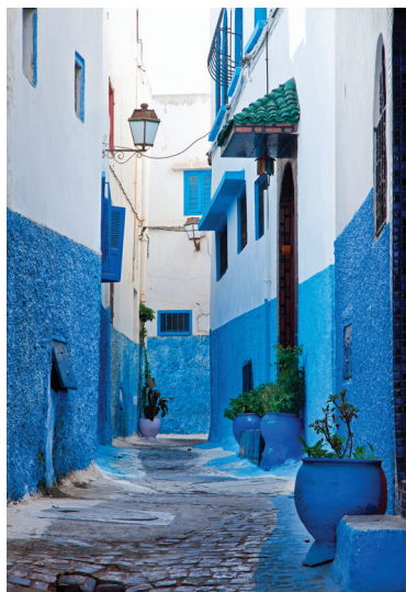
Rabat's Kasbah des Oudaias

Day 8: Erfoud/Rissani/Merzouga This morning we visit the city of Rissani, with its 18 th -century ksar , a virtually impenetrable warren of alleys. We enjoy a tour highlight this afternoon as we set out on a sunset excursion to the breathtakingly beautiful sand dunes at Merzouga on the edge of the Sahara. In the enormous silence we watch the sun set over the desert as we take a camel ride along the erg . Following this experience, we'll have dinner together in this desert setting before returning to our hotel tonight. B,L,D