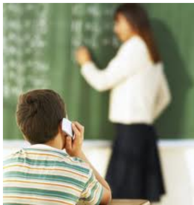
Figure 4 – Cell phone use in class disrupts a lecture.

The common consensus among educators is that student cell phone use in the classroom distracts from learning [16] [6]. This is echoed in various literature and statistics, much of which is cited in this paper. The two figures below, downloaded from Google's web site, exemplify typical misuse of cell phone on the classroom. Figure 3 shows a student talking on the cell phone not paying attention to the lecture. Figure 4 shows one student using a cell phone while the other student is distracted by this use.