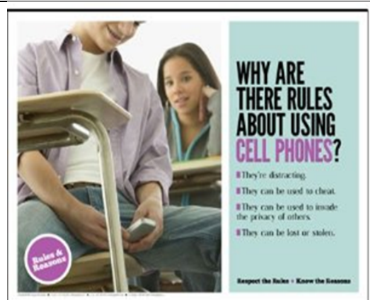
Figure 5 - Distraction by Cell Phone Use 1

The remainder of this section discusses these two opposite points of view. It begins by first explaining the misuse of cell phones in the classroom, and then it continues, explaining how some faculty have more recently been using cell phones in the classroom for educational and learning purposes.