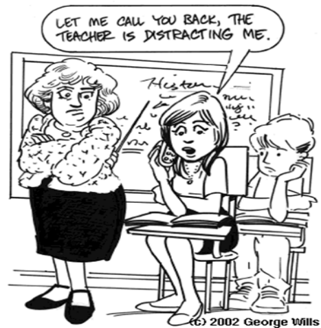
Figure 2 - Cell phone use in classroom 1

Figure 1 shows students openly using cell phones in the classroom. The implicit meaning from second figure is that the students feel they have inherited right to using the cell phone even in the classroom over the teacher's objection. The increasing capabilities of cell phone made them essential tool that cannot be banned at almost any place or setting. Therefore, a moderate solution may involve teaching the students the appropriate use of cell phones in the classroom.