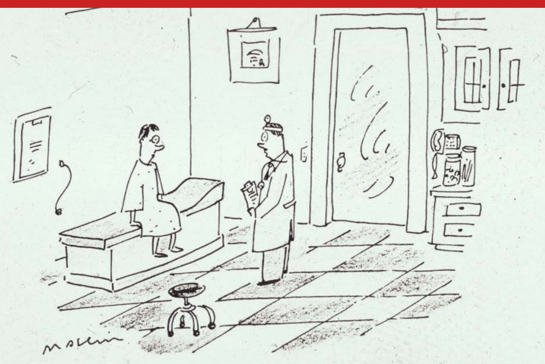
"Unfortunately, you have what we call 'no insurance."