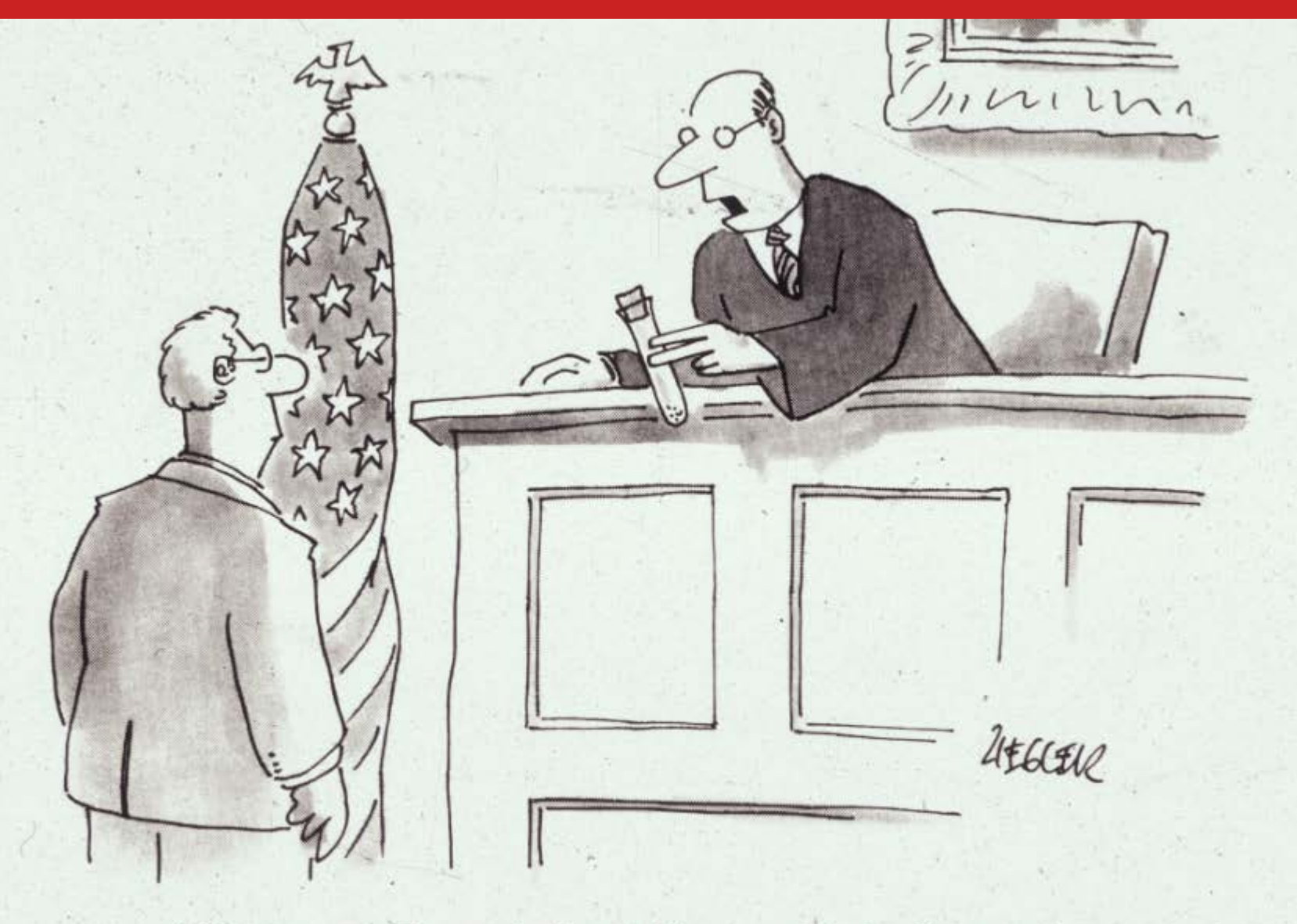
"Please accept the apologies of this court. You're free to go now, and, by the way, here's your DNA back."