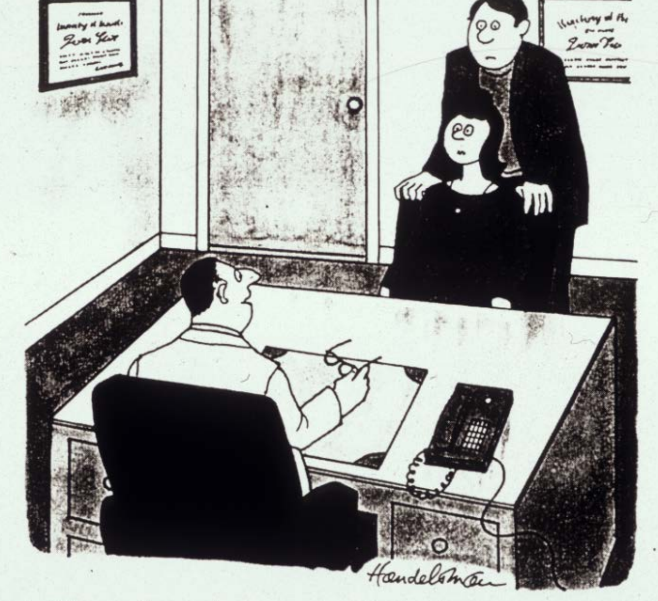
"The good news is that you will have a healthy baby girl. The bad news is that she is a congenital liar."