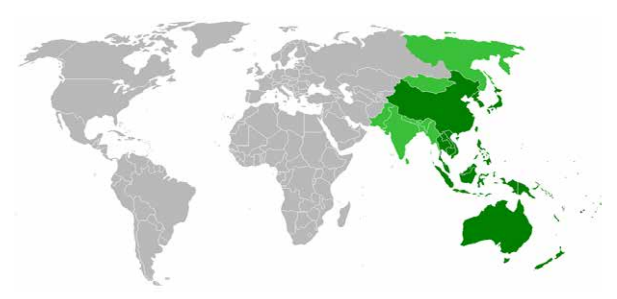
IMAGE: Map showing countries within the Asia-Pacific region. The definition of the region is fairly ambiguous

Gitanas Nauséda underlined the importance of maintaining an open dialogue among civilizations and close ties with Asian countries. The President said that "our nations are united by shared goals to better understand each