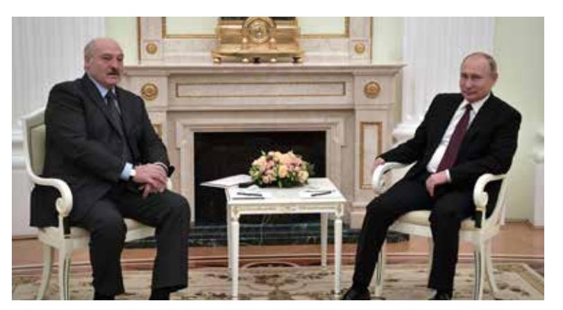
IMAGE: Russia and Belarus may enter a new phase of relationship

"There is a reason why Russians talk about nuclear weapons all the time – it is so that every foreign minister, defense minister, prime minister, member of parliament, member of Congress thinks that, they would actually use nuclear weapons and that they practice nuclear scenarios and all the related exercises. They don't make up some artificial locations: they talk about Warsaw, they name actual cities in the West as targets. Then you have their ambassadors to Denmark, a country that will