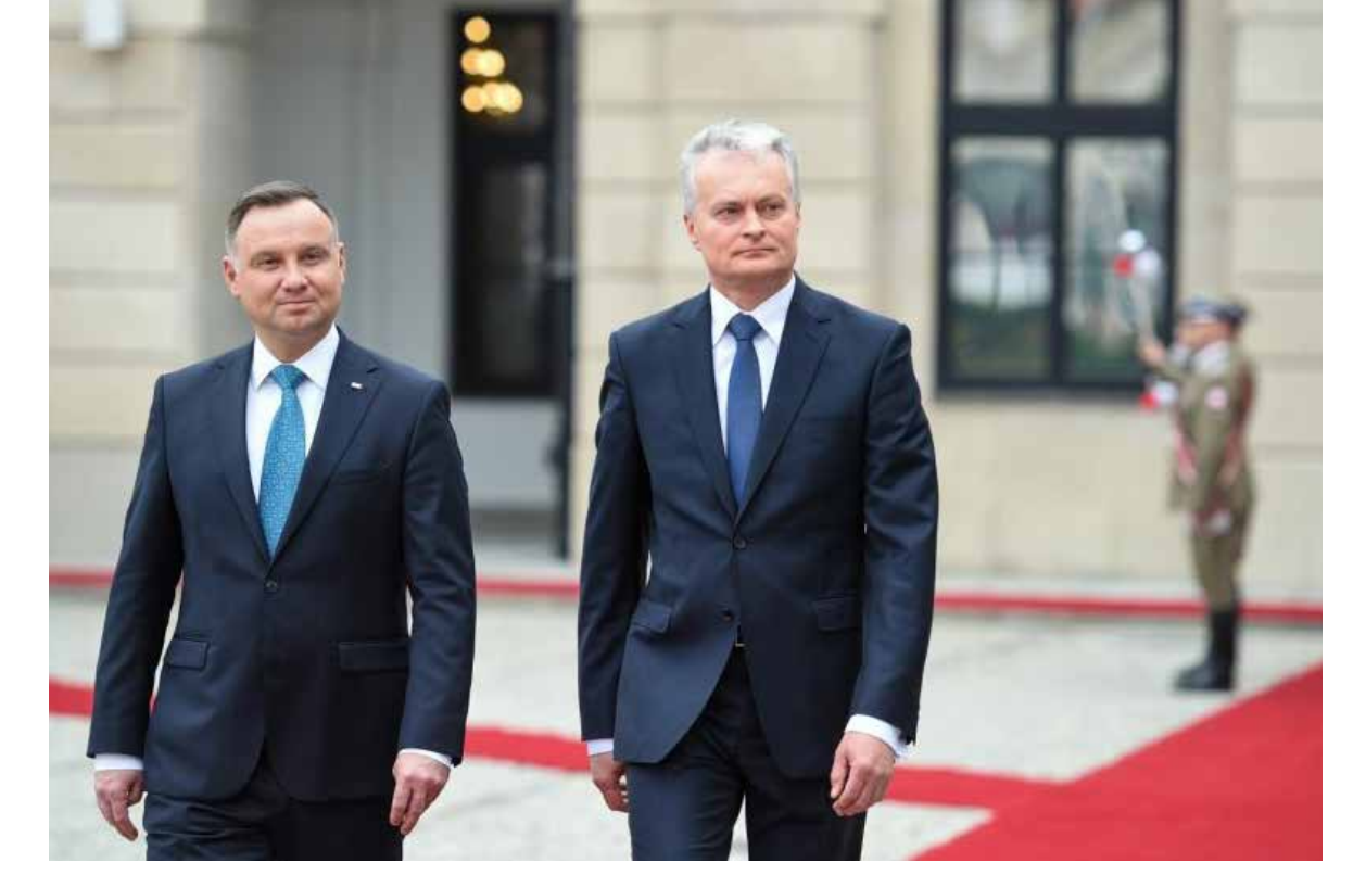
IMAGE: President of Poland, Andrzej Duda, and President of Lithuania, Gitanas Nausėda

)) By the time the presidential election campaign started in Lithuania, the relations between Poland and Lithuania had gained considerable momentum. The most popular candidates unanimously maintained that Poland was a priority country, without whose help it would be next to impossible to ensure the military and energy security of Lithuania, to develop infrastructural projects and to speak with a united voice in the institutions of the European Union.