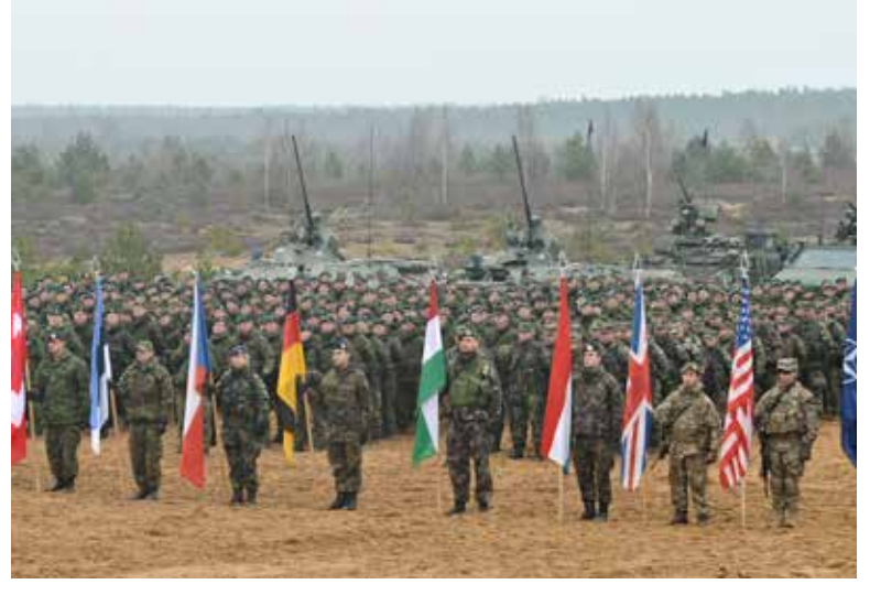
IMAGE: NATO allies in military exercises

After seventy years NATO is as strong and relevant as it ever was and still is the cornerstone of the defence of its member states. We all have a right to celebrate the