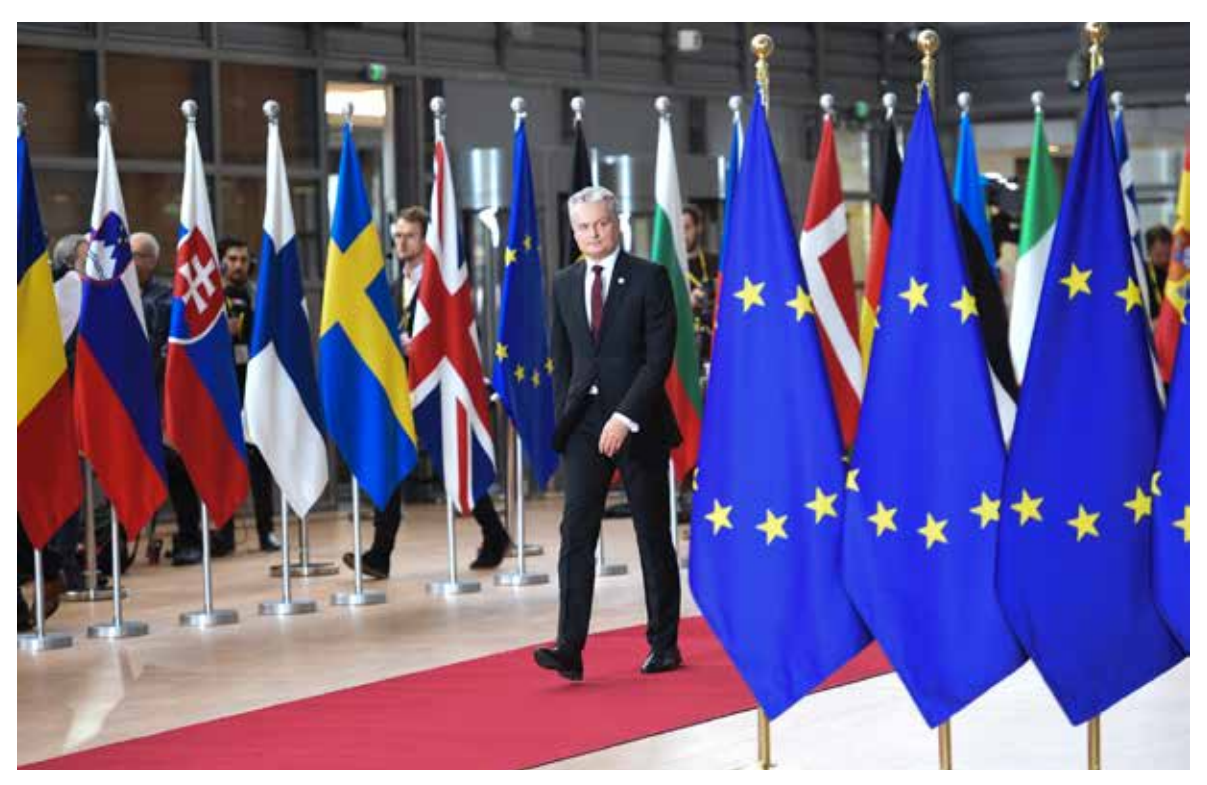
IMAGE: President Nauseda represents Lithuania in the European Council meetings

orientation and determination to introduce changes.