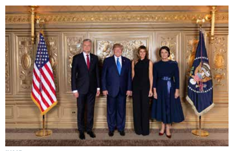
IMAGE: Lithuania hopes to maintain good relations with the U.S.

aggression in Ukraine. Deployment of Enhanced Forward Presence (EfP) multinational battalion-size battlegroups to the eastern part of the Alliance was one of them. What else is needed to strengthen deterrence in the region?