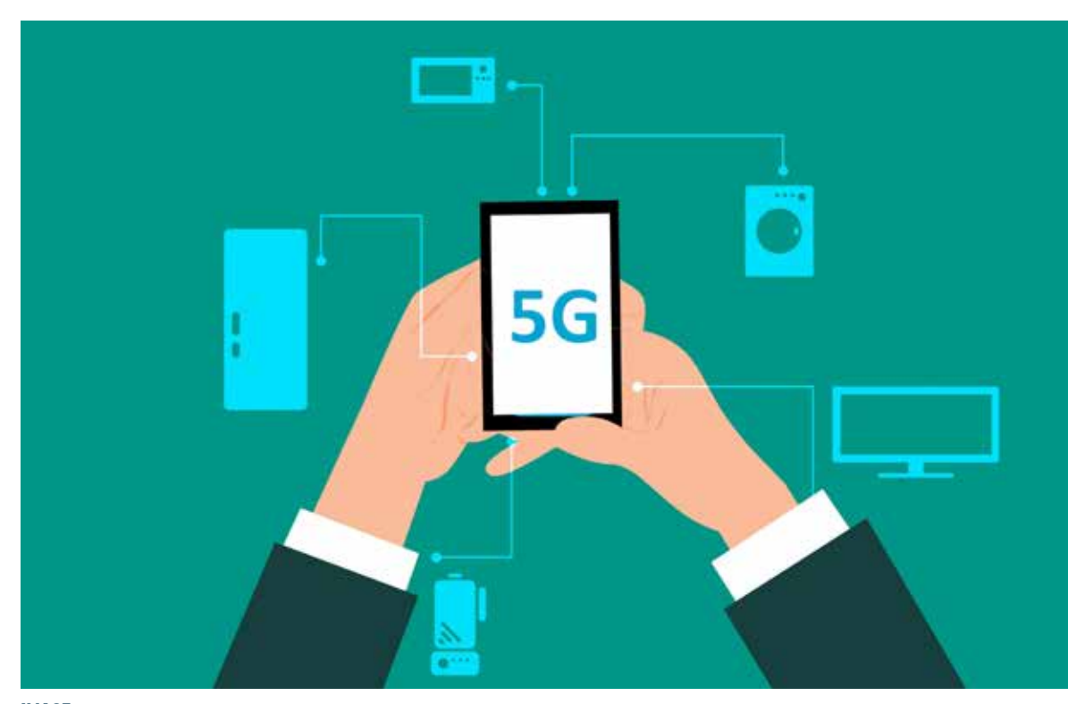
IMAGE: 5G development remains a contentious issue in US-China relations

allows for large data aggregators to do things that are contrary to the national interest without giving the government the means to reassert the rule of law. Totalitarian regimes are free then to use that same separation and private profit motive to gain assistance from those same technology companies to harness the power of data for their illiberal ends.