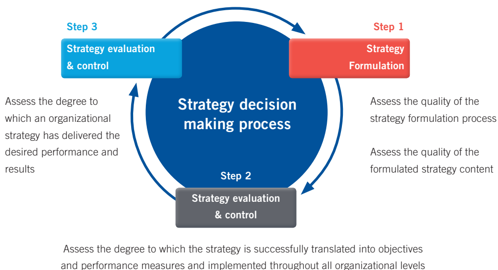
Figure 2: The three phases of a strategy process and their audit focus

The strategy process audits will be discussed in more detail than strategic risk audits (previous chapter), as strategy process audits are still less common practice. We trust that this will be useful for further discussion.