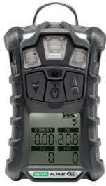
ALTAIR® 4X Mining Multigas Detector