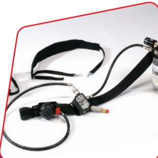
PremAire® Supplied Air Respirator System