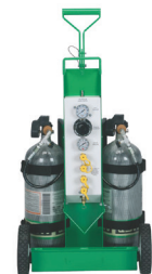
Compressed Airline Accessories