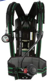
G1 Carrier and Harness Assembly