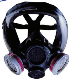
Advantage® 1000 Full-Facepiece Respirator