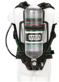
G1 Carrier and Harness Assembly