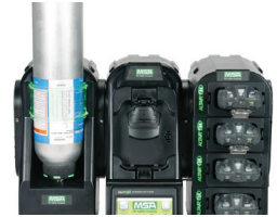
GALAXY® GX2 Automated Test System