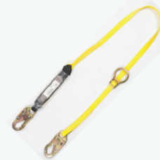
Workman® Energy-Absorbing Lanyard