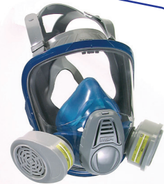
Advantage® 3200 Full-Facepiece Respirator