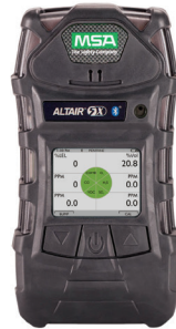
ALTAIR® 5X Multigas Detector