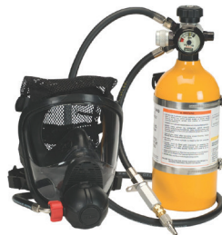
PremAire® Cadet Escape Respirator