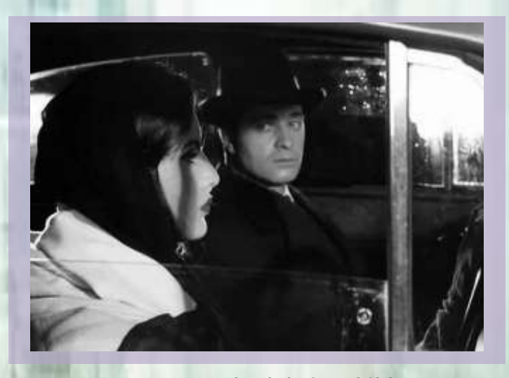
"Amerika" (1994) directed by Vladimír Michálek

For reservations: (310)473-0889, ext. 230 or at: losangeles@embassy.mzv.cz