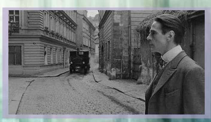
"Kafka" (1991) directed by Steven Soderbergh