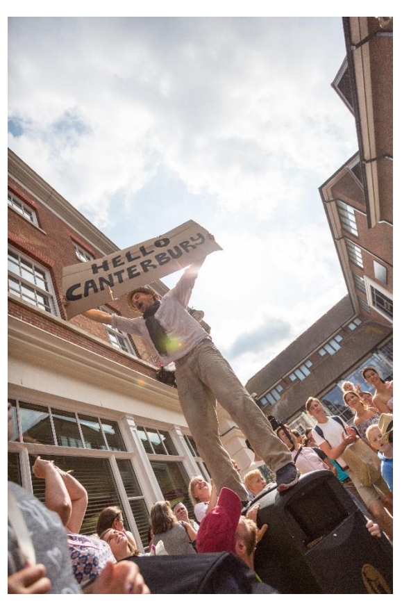
Dance Workshop

Trends in consumer behaviour highlight that there has been a shift in cultural tourism from seeing to experiencing, as such making the relationship between the cultural tourism provider and the consumer more critical to achieving differentiation and the creation of an authentic sense of place. The cultural tourist market is heterogeneous and attention needs to be paid to the degree to which culture is core or peripheral in terms of their motivation and depth of cultural experience sought. Understanding how consumers view themselves has important implications for the way in which culture and the arts are reflected in marketing communications.