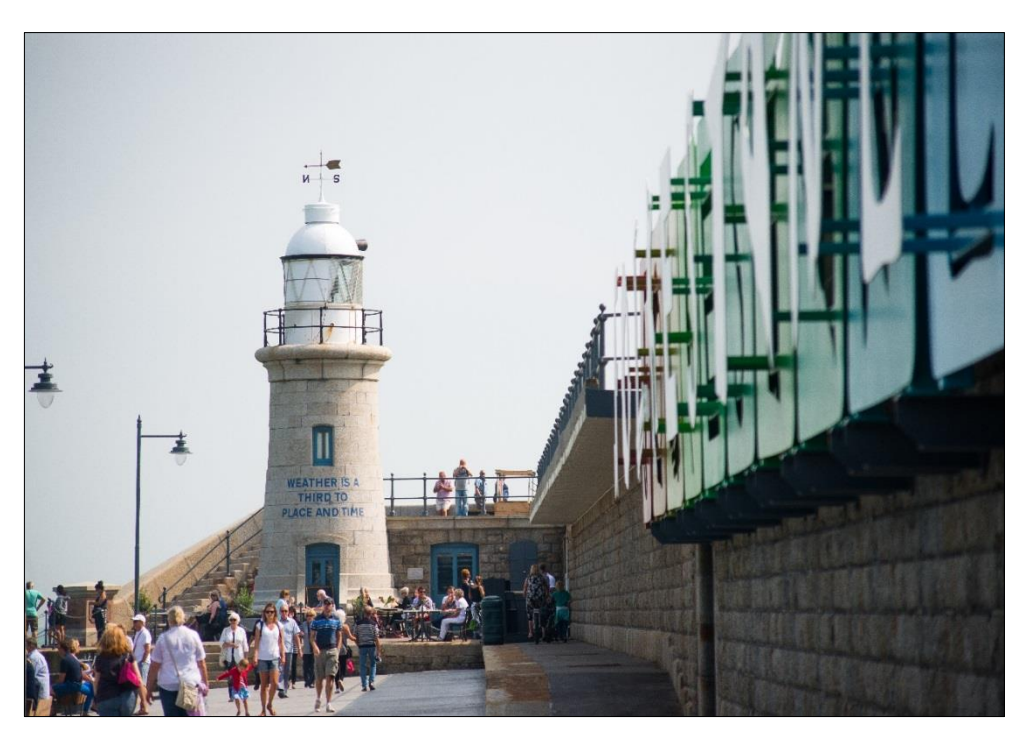
Harbour Arm Artworks, Folkestone.

in the generation of innovative new experiential products for tourism, whilst tourism can contribute to the growing of audiences and markets for arts and cultural organisations. The next section of the Evidence Review will consider how the cultural tourism offer can be defined in terms of the product, destination and experience.