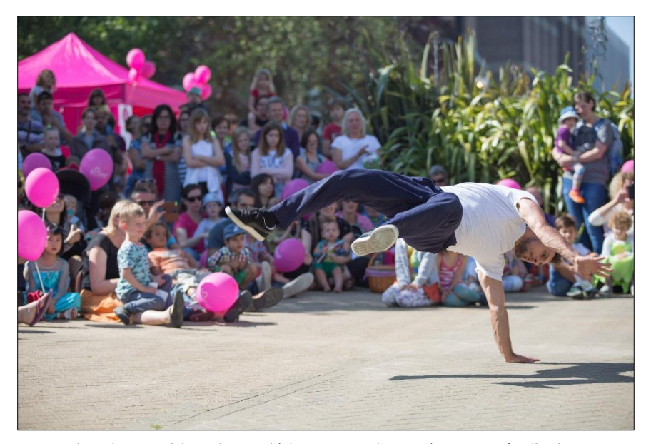
Urban Playground, bOing! Festival

Sections 4-7 below will set out the detailed findings of the full Evidence Review.