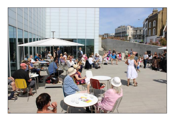
Tango on the Terrace, Turner Contemporary

Warwick Commission (2015) Enriching Britain: Culture, Creativity and Growth - The Warwick Commission on the Future of Cultural Value Coventry: The University of Warwick.