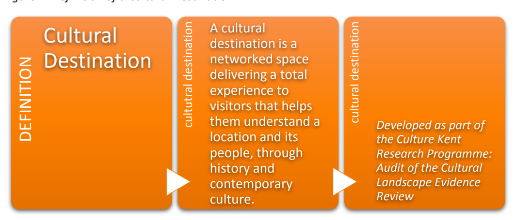
Figure 2: Definition of a Cultural Destination

This definition builds on Lord's (1999) recognition of the importance of linking the 'greatly motivated' and 'adjunct' cultural markets within a destination by means of creating partnerships and packages between the cultural and noncultural offer. This is also a theme that will be taken up again when the review examines the nature of the cultural tourism consumer (Section 6). The working definition further refers to the role of IT and mobile technologies in pulling the destination together and making it apprehensible and available to the visitor (c.f. Palmer 2013, Culture24 2012, The Culture Module 2012), and leaves open the question of destination boundaries to include destinations of different scales, diffuse regions, routes and corridors (The Culture Module, 2012). The definition does, however, come down on the side of recognising the importance of location, and delivering a sense of place as part of the cultural offer.