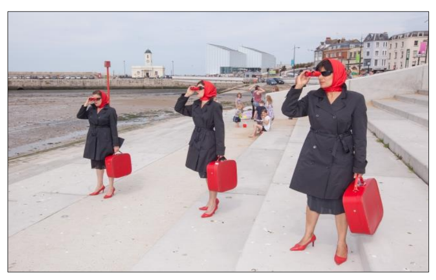
Red Ladies

Following this, an audit of the existing data collection methods and techniques utilized by a sample of 30 organisations within Kent was conducted, via a SNAP survey to cover current practices, aspirations, barriers and potential for future data sharing. The 30 organisations were selected from current Audience Finder users, potential Audience Finder users as well as key tourism organisations across the county. The objective of the survey was to gather as much information as possible about how, and if, organisations collect data and the level of relevance that data plays in the development of their organisation.