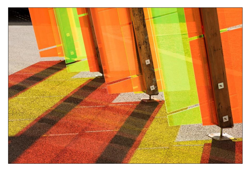
Dutch/Light by Jyll Bradley.