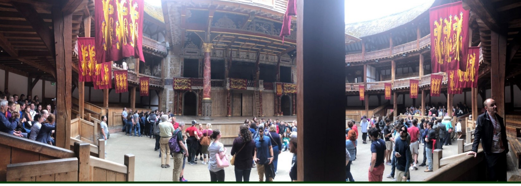
Shakespeare's Globe in London