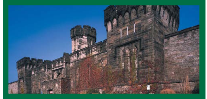
Eastern State Penitentiary