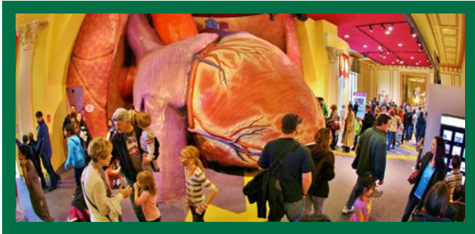
Franklin institute science museum