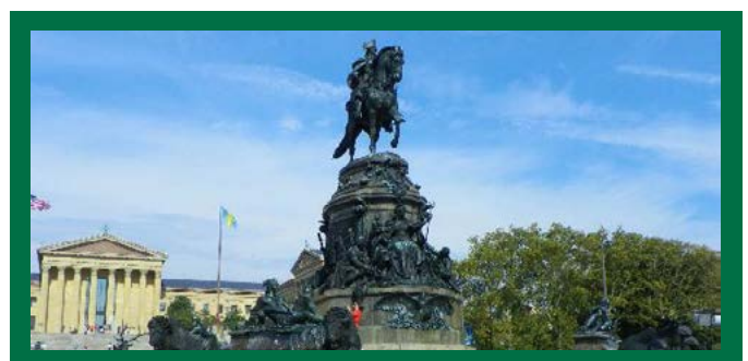
The Washington Monument at Eakins Oval