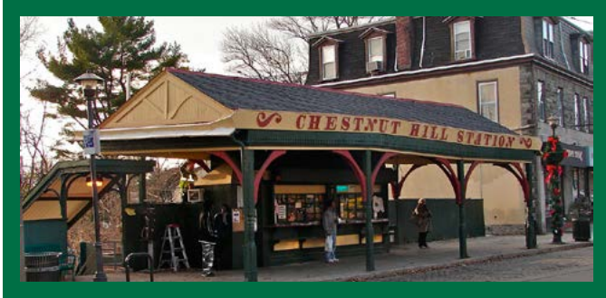
Chestnut Hill station