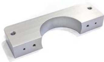
361428 BLOCK, SPHERICAL REPAIR