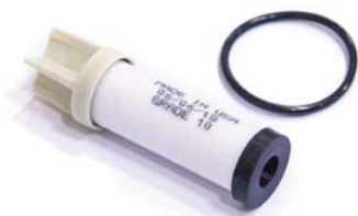
349633 FILTER ELEMENT, FFC-112