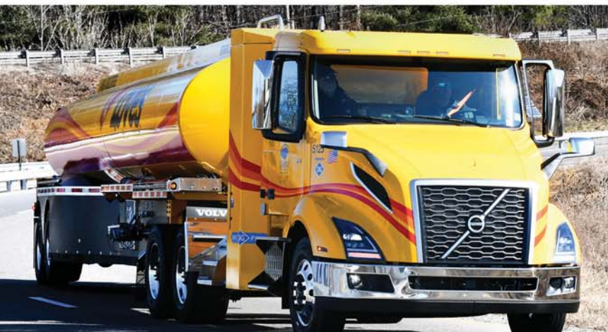
117 DGE HYBRID BACK OF CAB