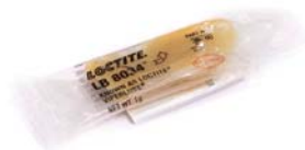
368905 LUBE, O-RING, 1CC