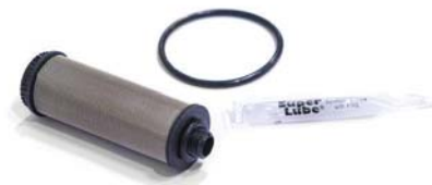
378473 FILTER ELEMENT, COAL, P36