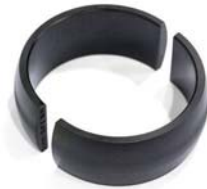
360306 BUSHING, CYL, INNER