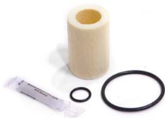
378049 FILTER ELEMENT, COAL, P36