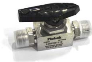
378052 VALVE, 2BALL, 6 MOFS, 6 MOFS