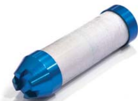
357035 FILTER ELEMENT, COAL, P36