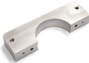
361429 BLOCK, SPHERICAL REPAIR