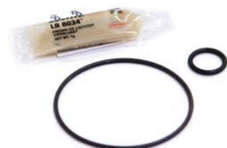
362474 O-RING, KIT, COAL, P36