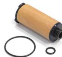
372781 FILTER ELEMENT, COAL, P36