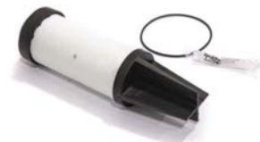
361597 FILTER, KIT, COAL, P36