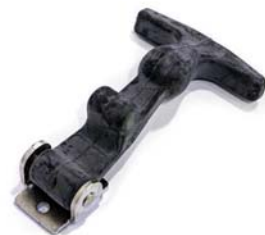
364444 LATCH, T-HANDLE ASY, RUBBER