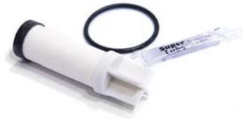
401280 FILTER ELEMENT, COAL, P36