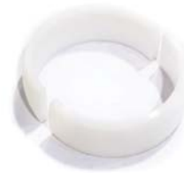
361427 BUSHING, CYL, REPAIR