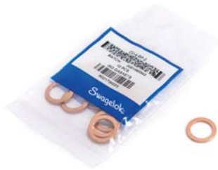
357087 F, SEAL, 4 BPP COPPER