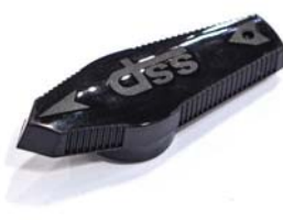
389470 VALVE, HANDLE, BLACK