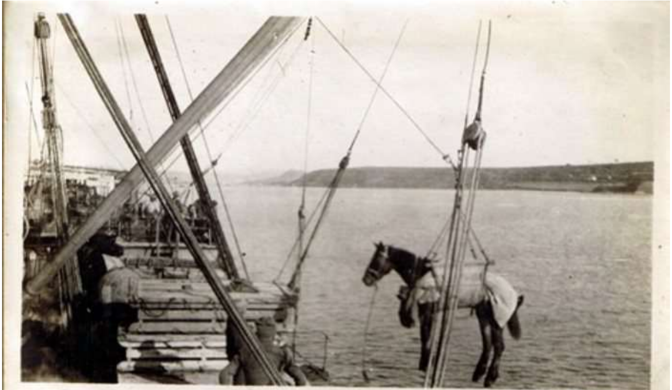
METHOD OF SLINGING HORSES INTO LIGHTERS. N.Z. TRANSPORT. H.M.T. HUNTSCASTLE.