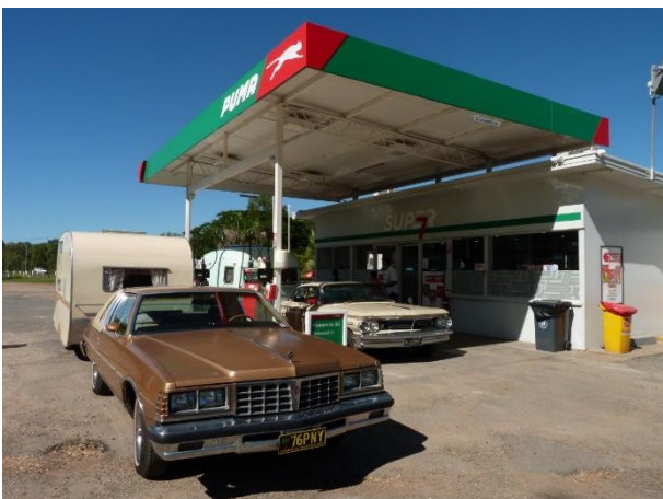
Fueling up the Bonneville's at Marlborough

Overall we did 2465 miles on the trip without any problems to either the cars or the caravans.