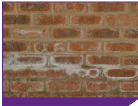
Efflorescence from ground salts