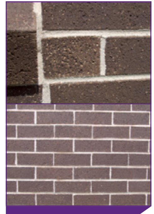
Damage to bricks caused by incorrect use of high pressure water jet cleaning