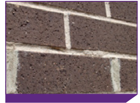
Damage to ironed mortar joint