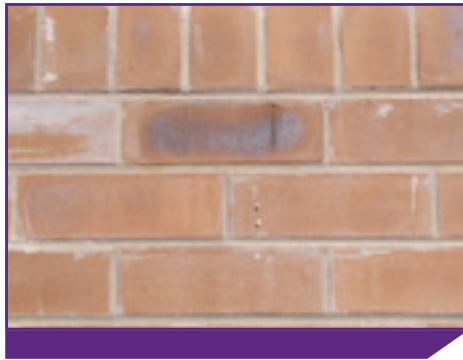
Signs of manganese staining