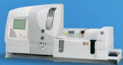
ABX Pentra DX 120 SPS Evolution