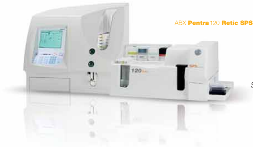
ABX Pentra 120 Retic SPS

120 tests/hour 36 parameters Slide-maker* (ABX SPS) * Option