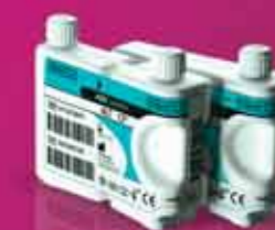
ABX Pentra liquid reagents