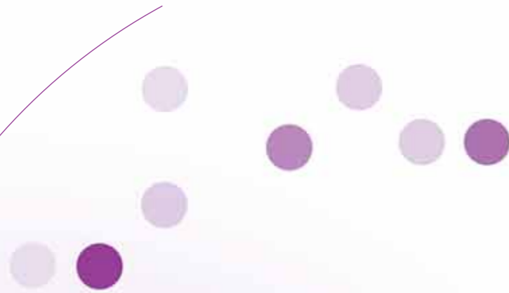
ABX Pentra XL80