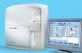
ABX Pentra ES 60