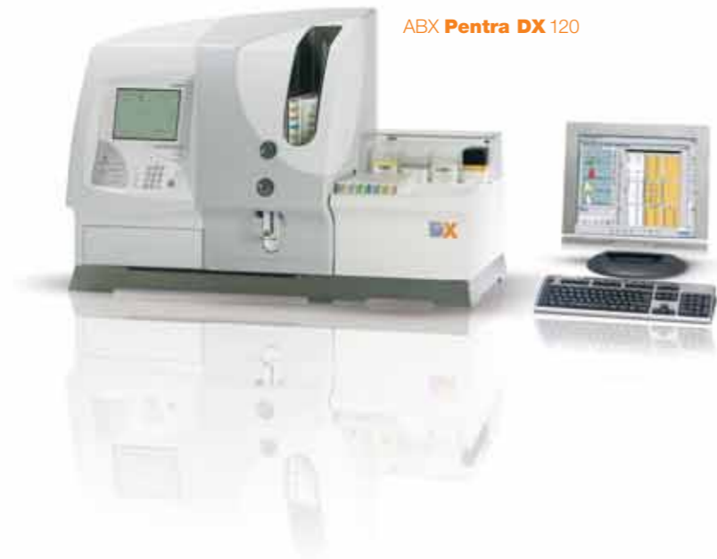
ABX Pentra DX 120

120 tests/hour 45 parameters Expert validation system (ABX PENTRA ML)