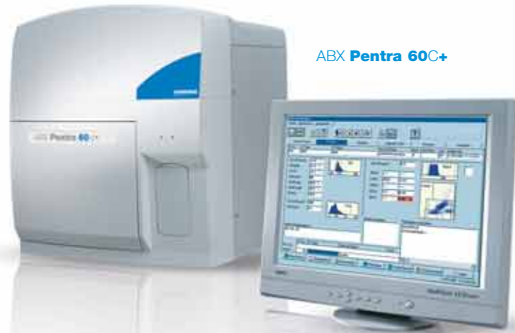
ABX Pentra 60C+