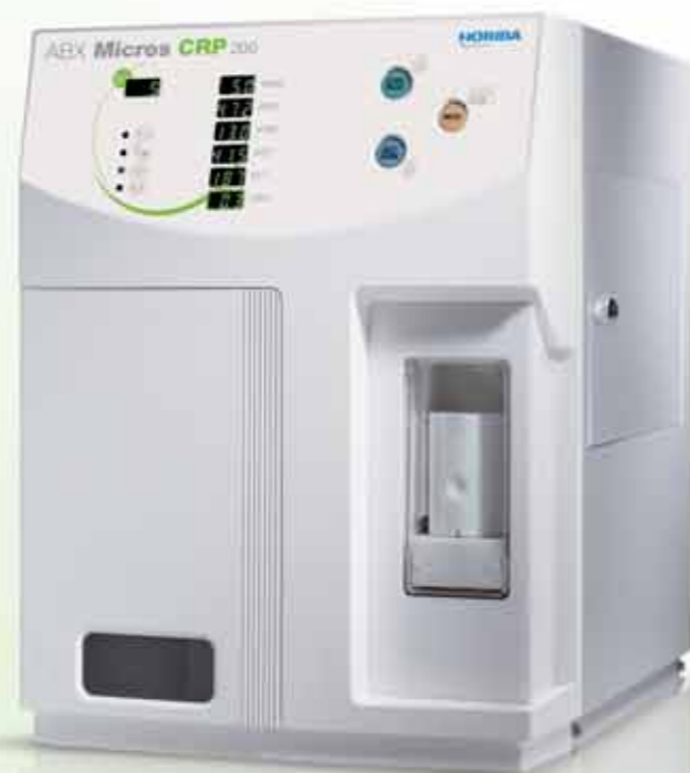
ABX Micros CRP 200