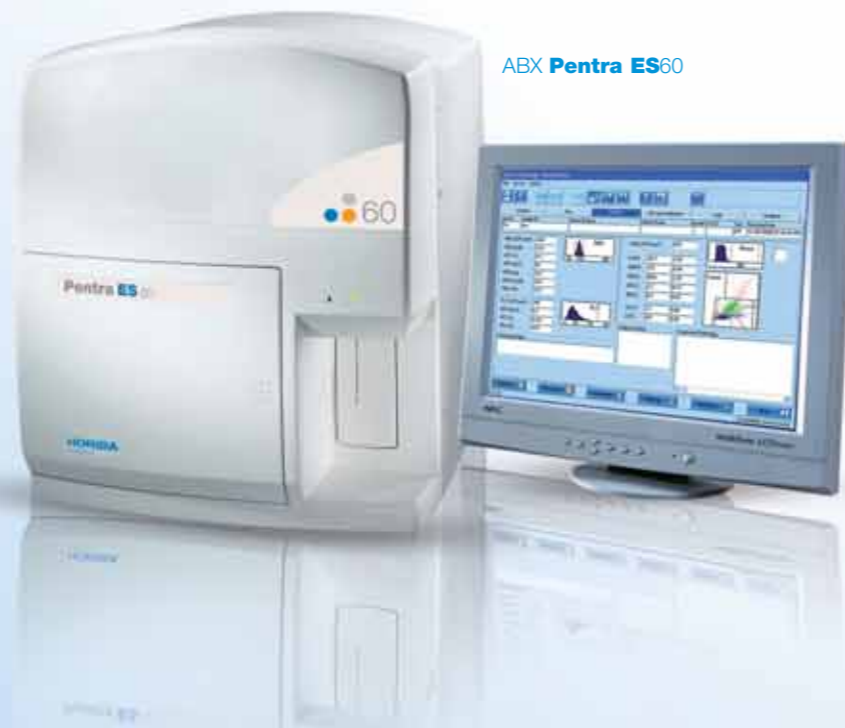
ABX Pentra ES60