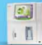
ABX Micros ES 60