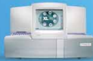
ABX Pentra XL 80