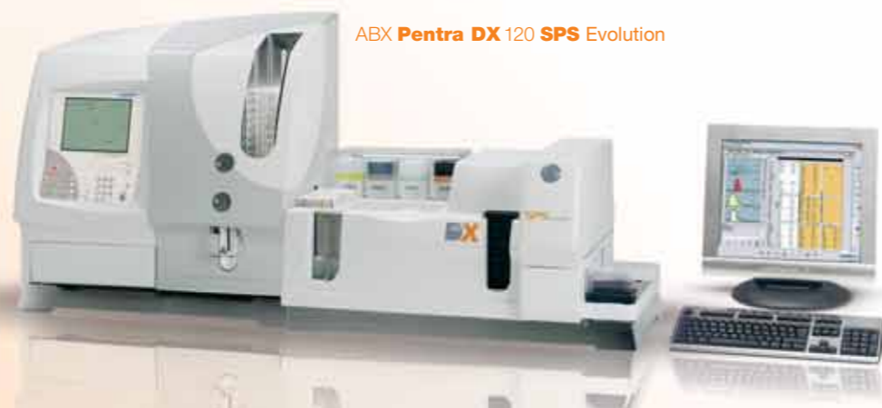
ABX Pentra DX 120 SPS Evolution