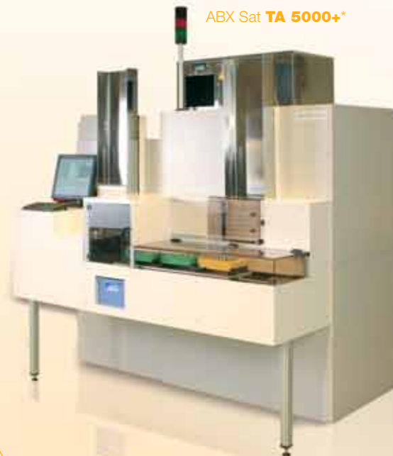
ABX Sat TA 5000+