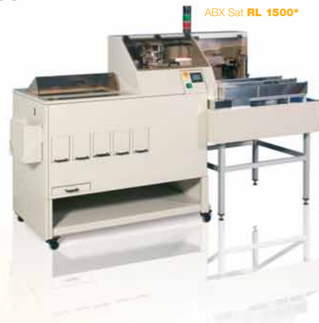
ABX Sat RL 1500+