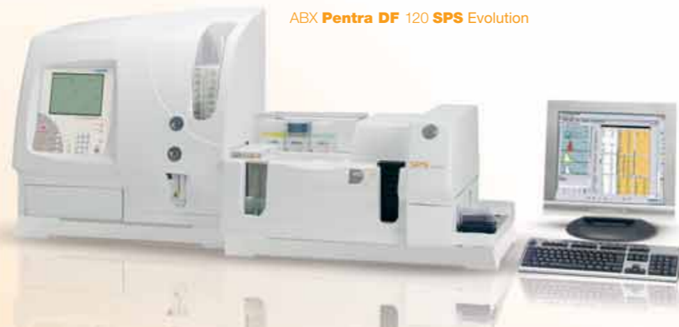
ABX Pentra DF 120 SPS Evolution