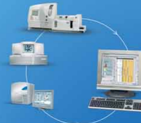
ABX Pentra ML