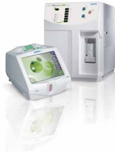
ABX Micros CRP 200 e-sat