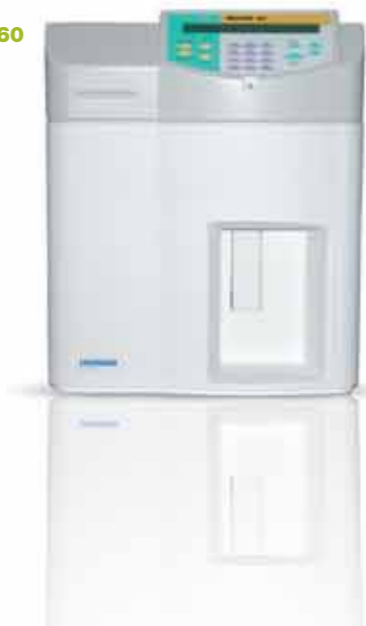
ABX Micros 60