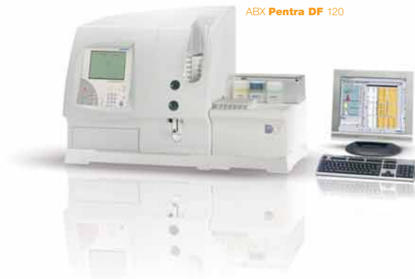
ABX Pentra DF 120