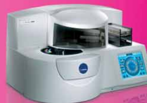
ABX Pentra 400