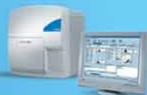
ABX Pentra 60 C+