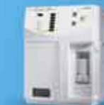
ABX Micros CRP 200