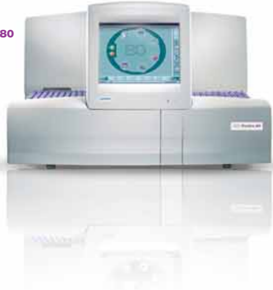
ABX Pentra 80