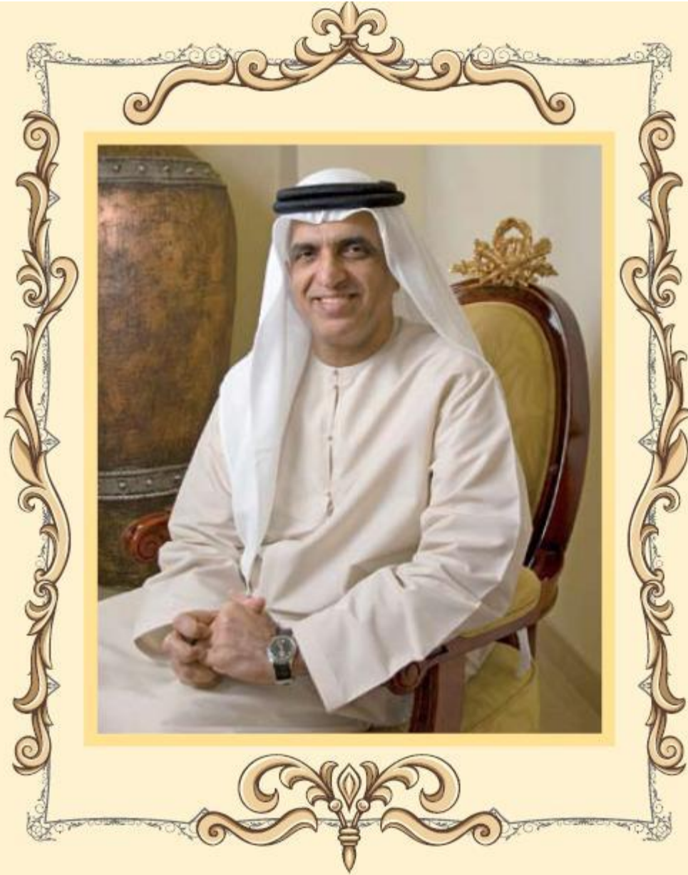
His Highness Sheikh Saud Bin Saqr Al Qassimi Ruler of Ras Al Khaimah, and Chancellor American University of Ras Al Khaimah