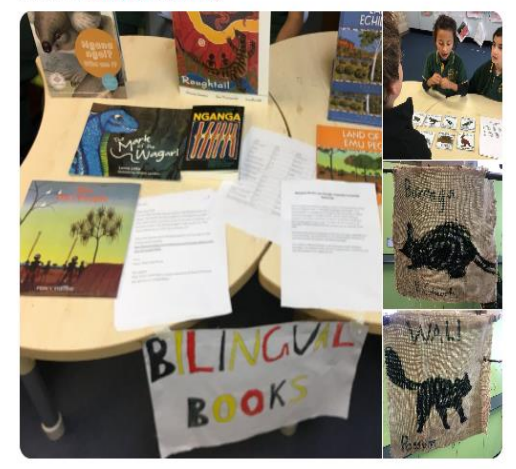
Q 1] 5 🛇 13 🗹

Quokkas CPS 2019 @QuokkasCPS - Aug 8 We are looking forward to seeing our Gadigal language resources used across the school. We will continue to work towards changing our class names from English to Gadigal! #projectbasedlearning