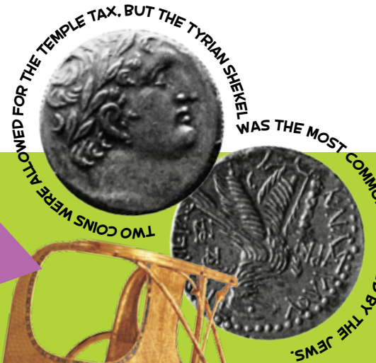
TWO COINS WERE ALLOWED FOR THE TEMPLE TAX, BUT THE TYRIAN SHEKEL WAS THE MOST COMMON COIN USED BY THE JEWS.

PHILIP DIDN'T WALK; HE RAN TO THE ETHIOPIAN'S CHARIOT TO SPEAK WITH HIM ABOUT JESUS. THIS CHARIOT IS FROM ANCIENT EGYPT.