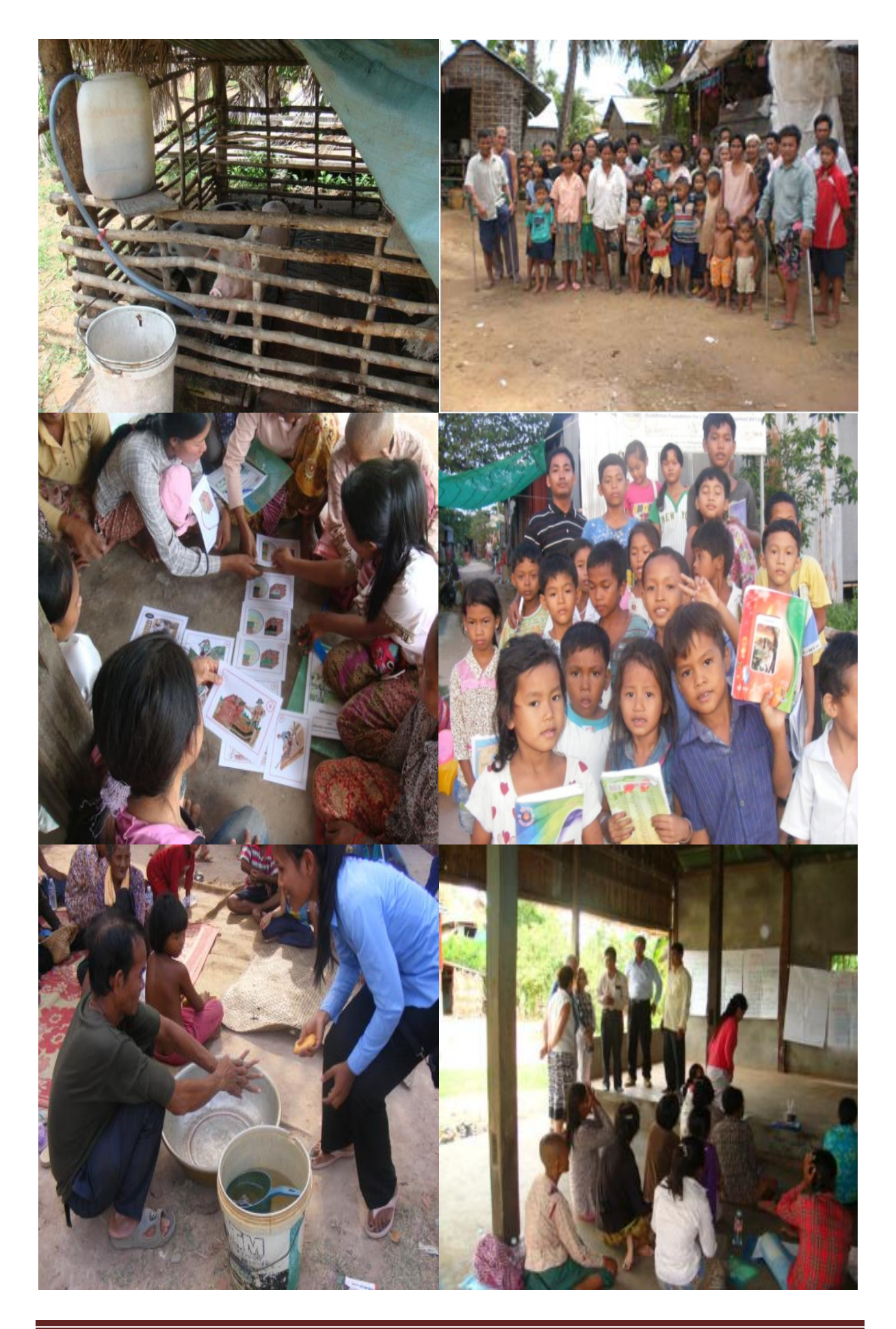
BFCD-Project Proposal on Integrated Community Development from Jan-Dec 2014